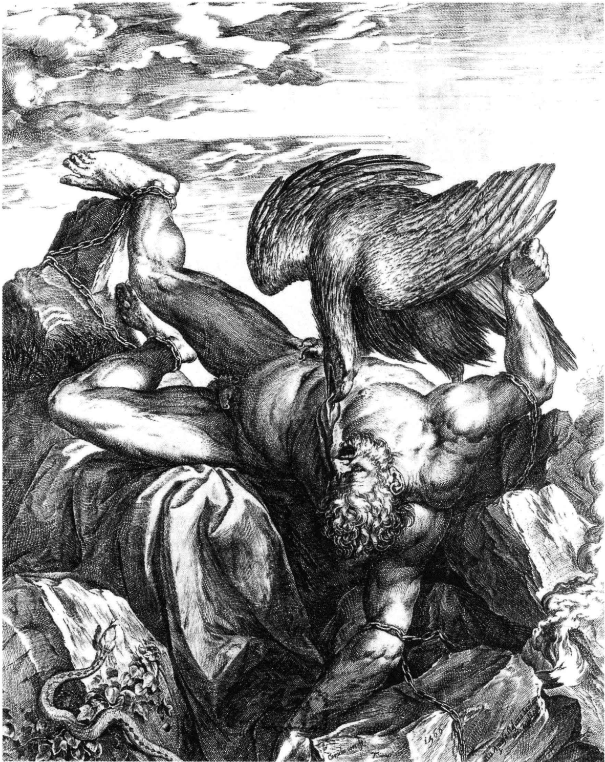
Prometheus, chained to the rocky Mount Caucasus, has his liver eaten by the eagle of Zeus. (Engraving, 1566, possibly after a work by Titian.)