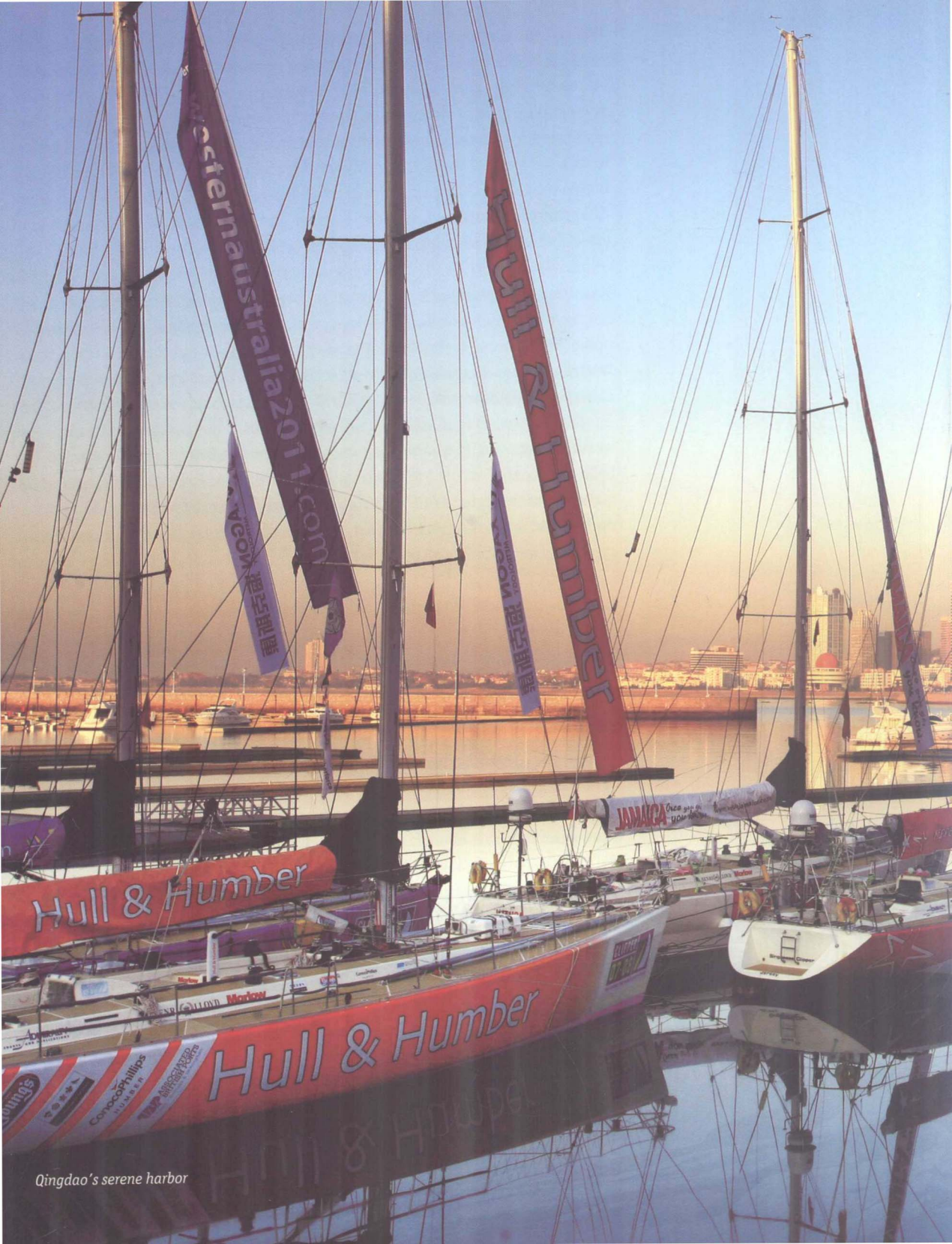
Qingdao's serene harbor