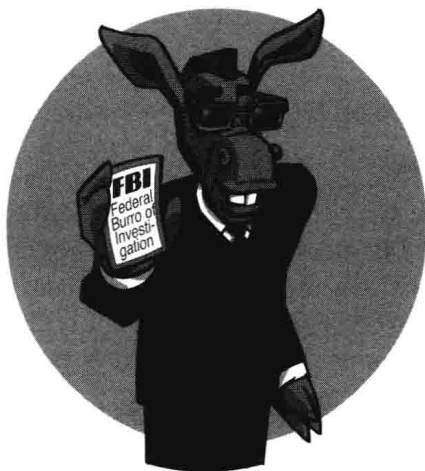
The Federal Burro of Investigation.

FUN FACT: "Un mataburros" is slang for a dictionary in Mexico and South America. "Un burro" is also a slang word for someone whose taco, let's say, is "missing a few ingredients."