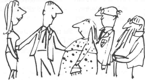
He introduced the guests to his wife