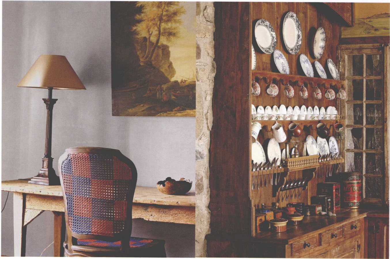
A cosy, scholarly retreat