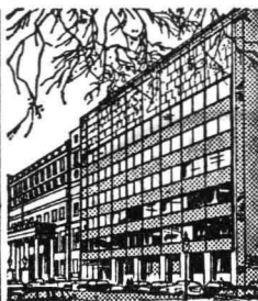
Lincoln's Inn Fields Laboratories

Please write for further information to: The Secretary, Imperial Cancer Research Fund (Dept. 193). P.O. Box 123, Lincoln's Inn Fields, London, WC2A 3PX