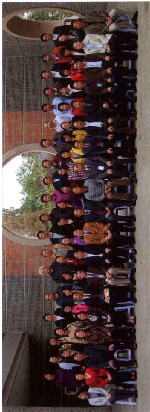
The officially registered participants of the 9th Conference of CALS