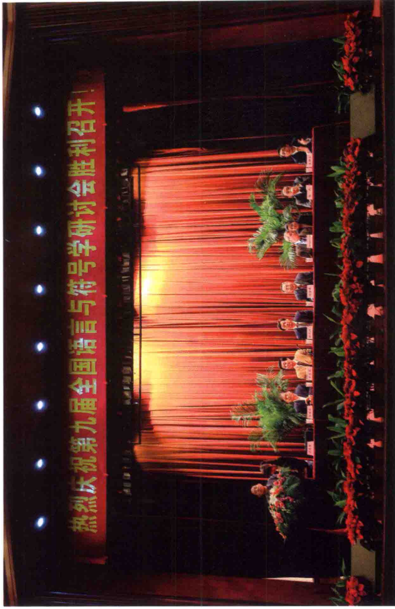
The opening ceremony of the 9th Congress of Chinese Association of Linguistic Semiotics (CALS)