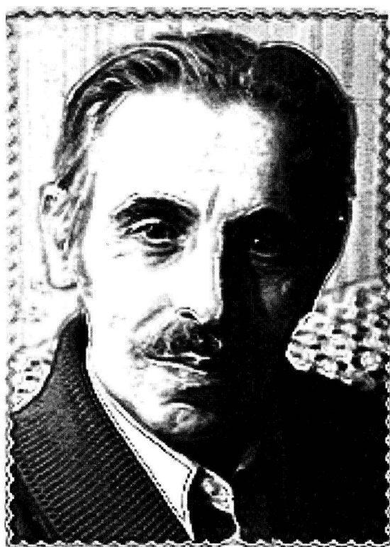
Father, Teacher and Mentor (1920–2007)