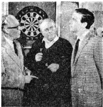
35. You're the man whose editor wants a story about our darts match