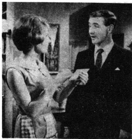
18. I've been waiting to share the surprise with you