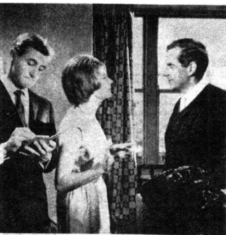
7. Uncle William telephones twice a week