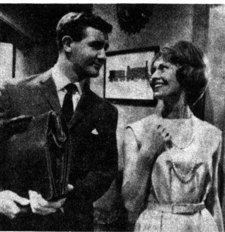
5. You do look nice