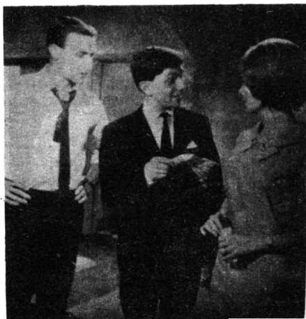
20. I've been hoping for a rise for a long time, but I got much more than I expected