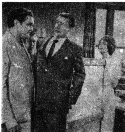
13. We've finished our work for today