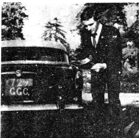
31. This must be the stolen car