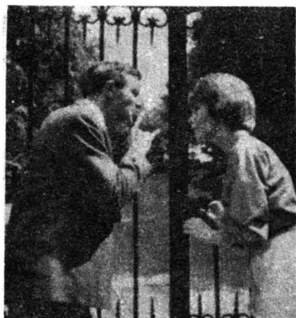
26. I'm going to look for him