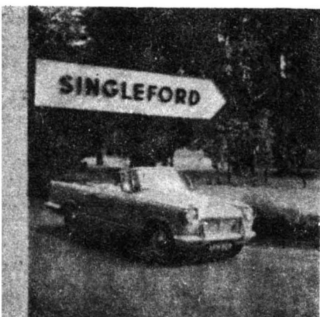
25. Look at that signpost