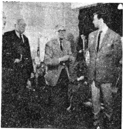
37. We need a man whose home is in Warchester