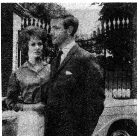
27. I said I was looking for the General