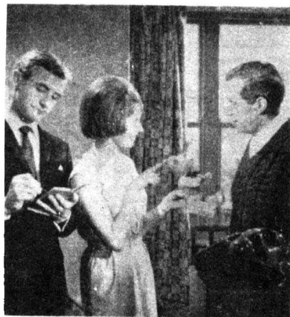
8. When he sees this he always stops crying at once