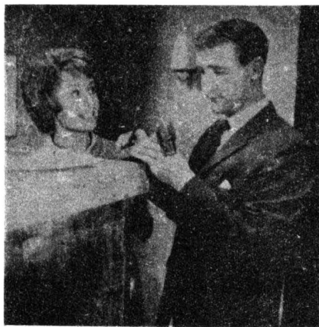
14. I've brought you some tools to open the box