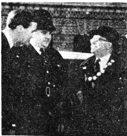
34. The man you're addressing is the Mayor of Warchester