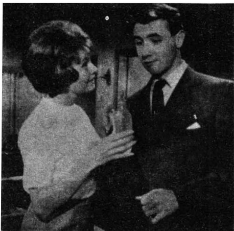
17. I've been feeding the baby