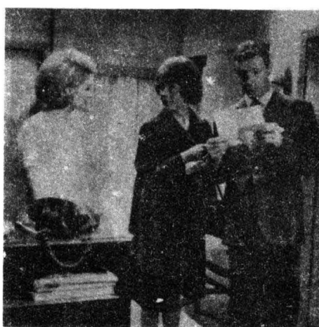
16. And a box has arrived