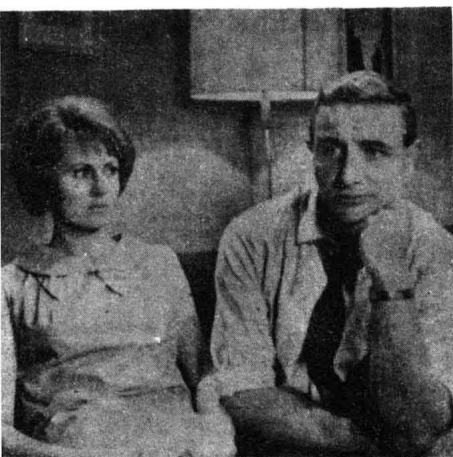
19. I've been working hard for three months and now this!