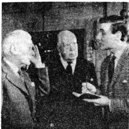
36. You're the man whose story I want