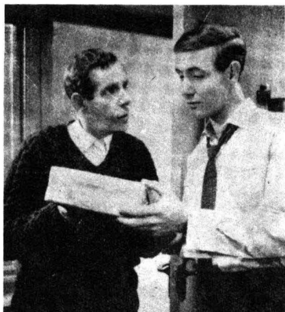
6. They came several hours ago