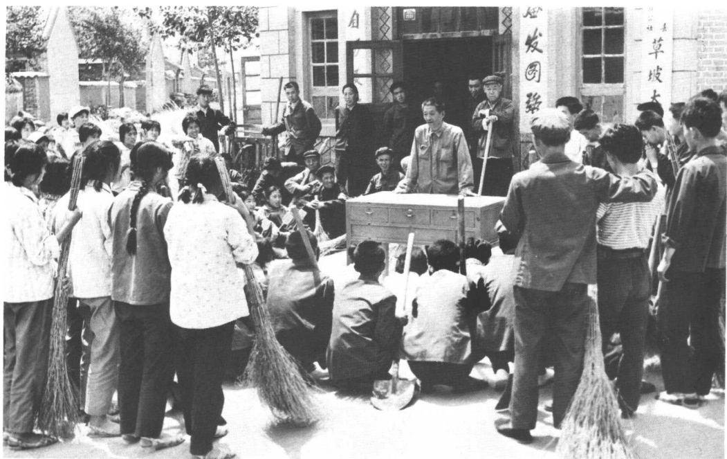
Mobilizing the community for a Patriotic Health Campaign