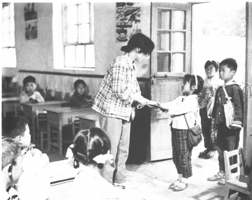
Encouraging hygienic habits in children