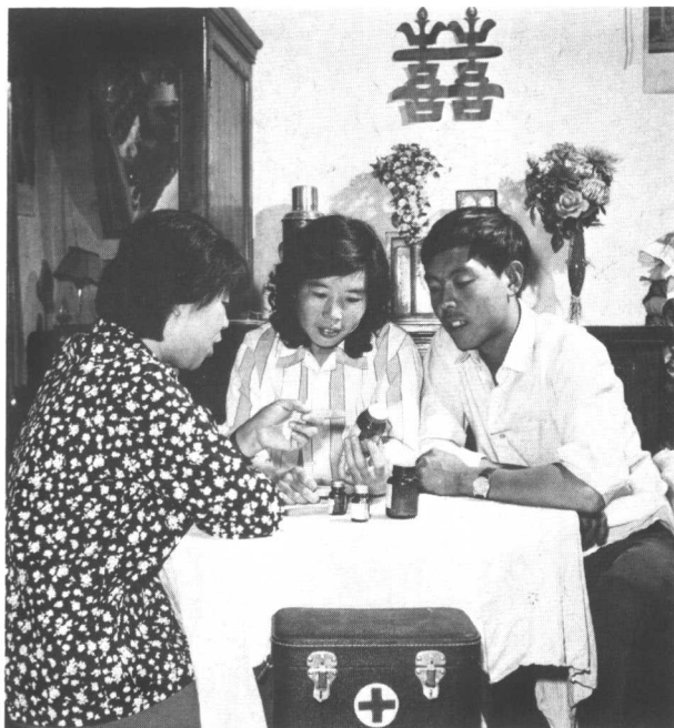
Family planning: a young couple is instructed by a barefoot doctor in the use of contraceptive pills