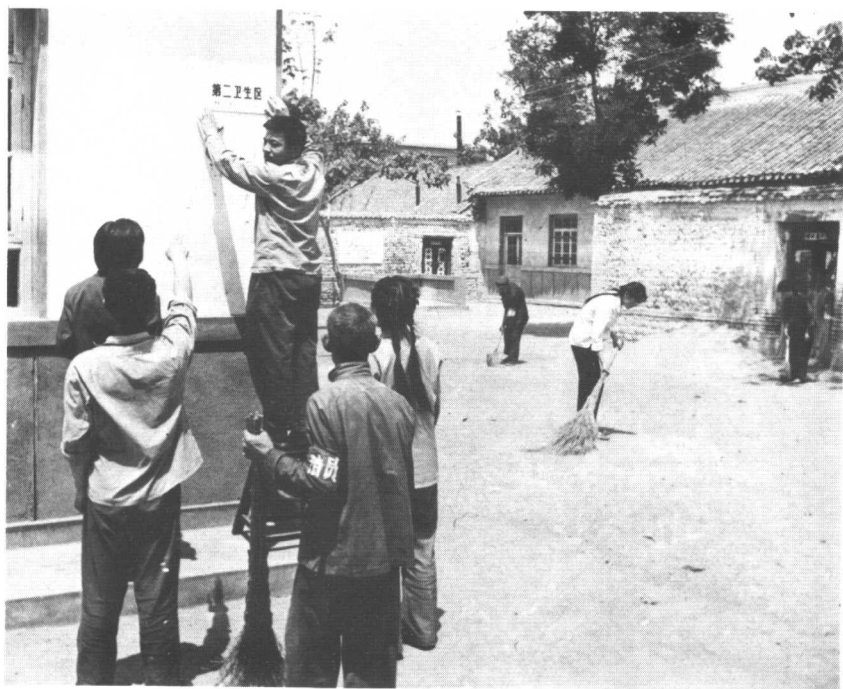
The Campaign gets under way as the streets are swept and cleaned by the people