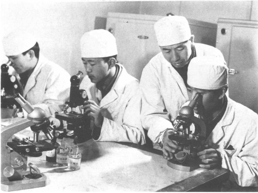
Laboratory workers being trained at a county hospital