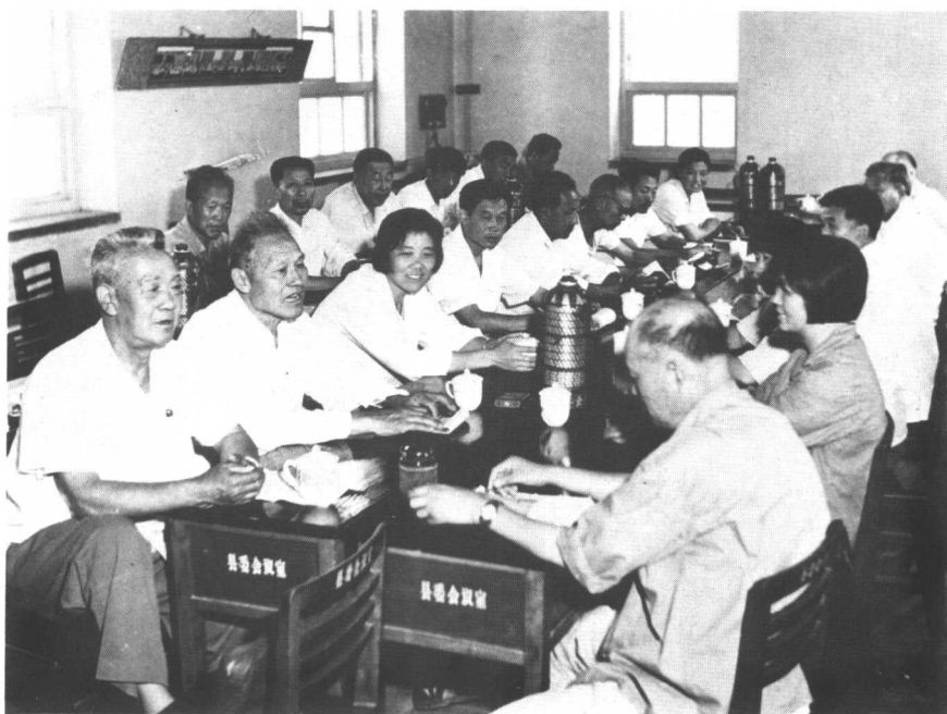
Involvement of the people in health management. Above: One of the "leading groups" or subcommittees dealing with cooperative medical care at the brigade level. Below: People's representatives at the county level discuss the launching of a Patriotic Health Campaign