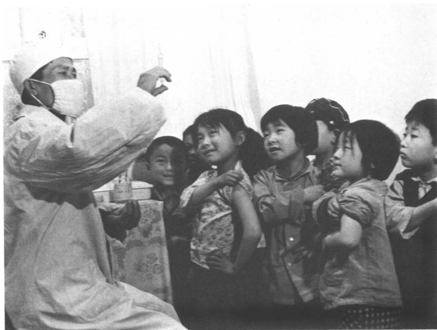
"Prevention First" is a basic principle of China's rural health services