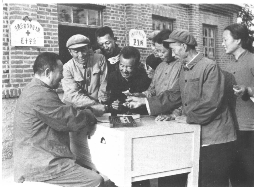
The people pay their contributions towards cooperative medical care