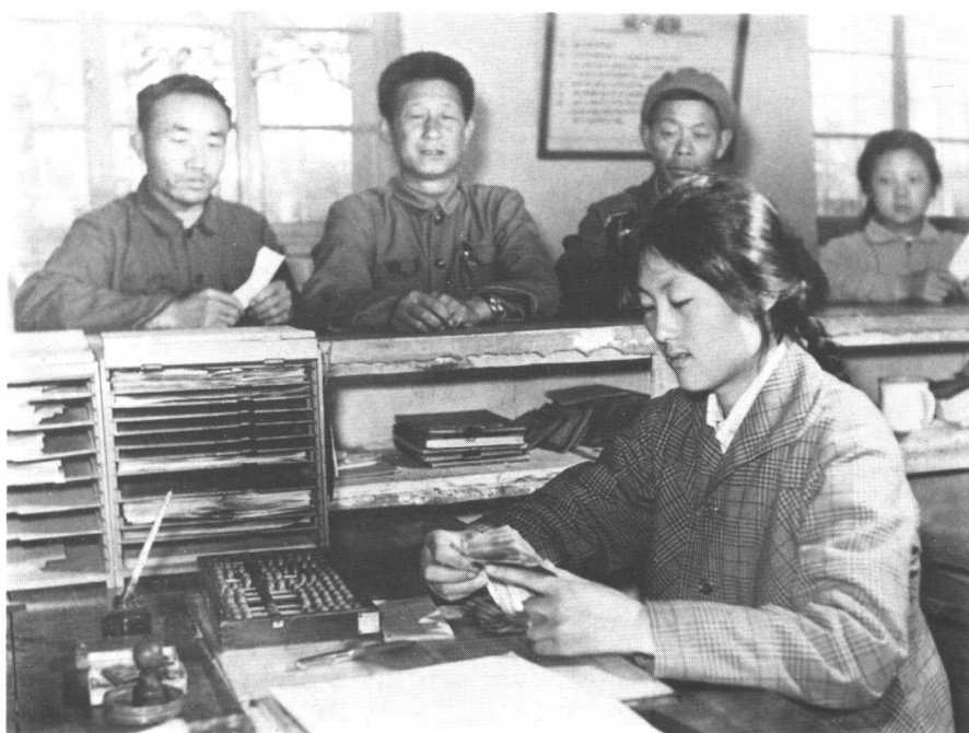
Funds are submitted by brigade accountants to the group dealing with cooperative medical care at the commune level