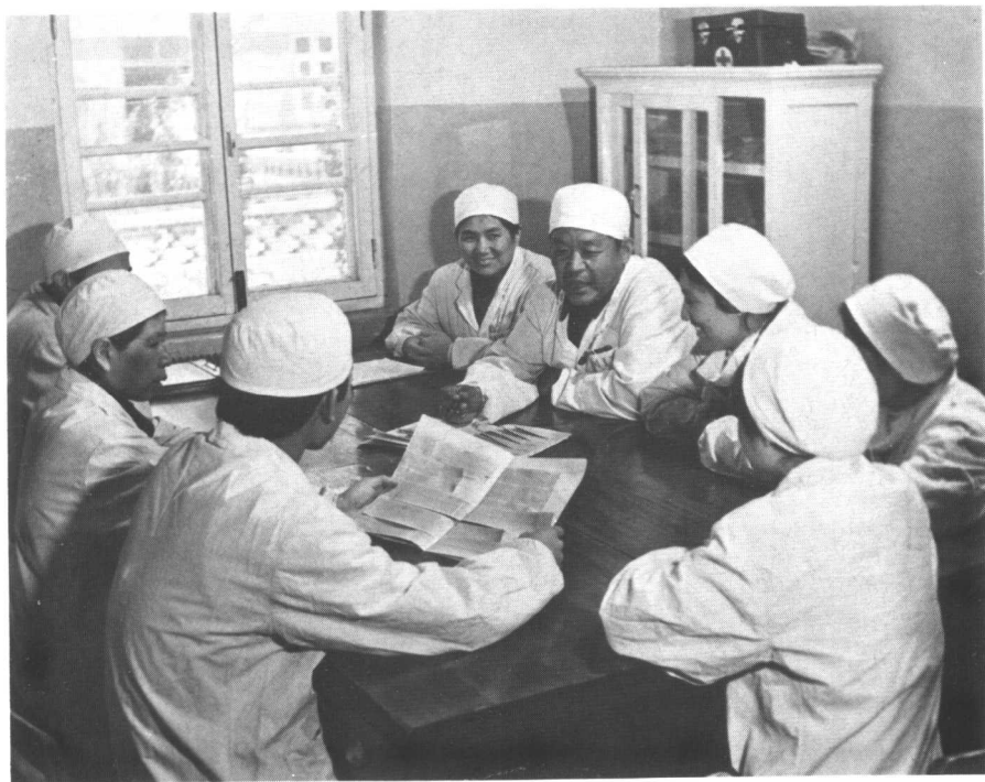
A primary health care team meets to plan activities