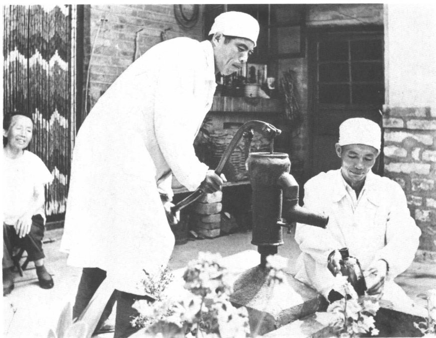
Taking samples of drinking-water for analysis