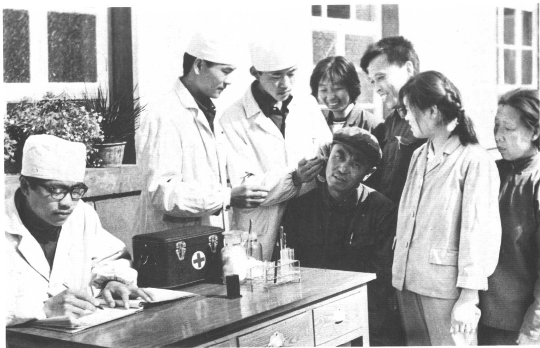
Health survey in a rural area