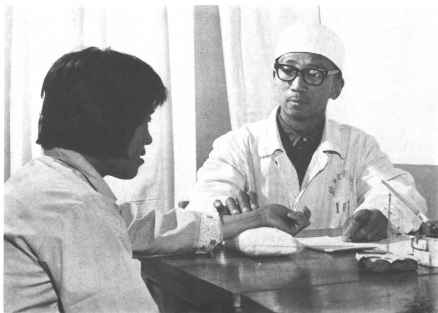
Feeling the pulse—a traditional method of diagnosis