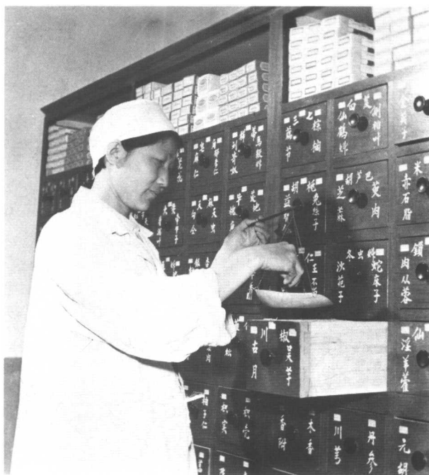
Dispensing medicinal herbs. These herbs play an important part in China's traditional pharmacology