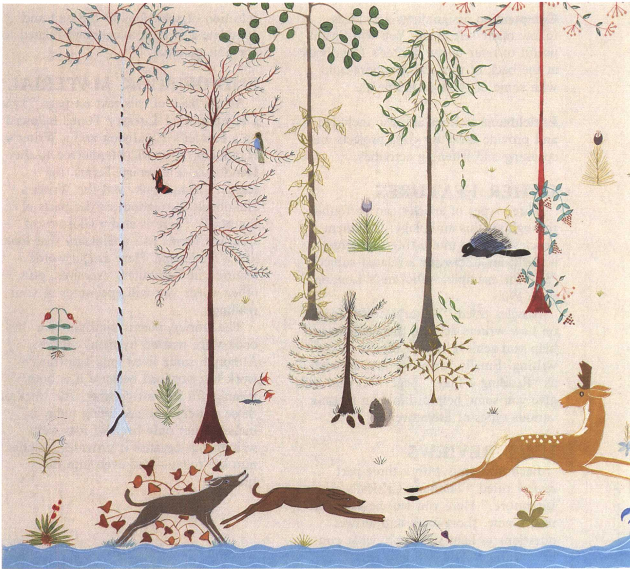
Merina Lujan (Pop Chalee), The Forest (detail), 1936, Private Collection