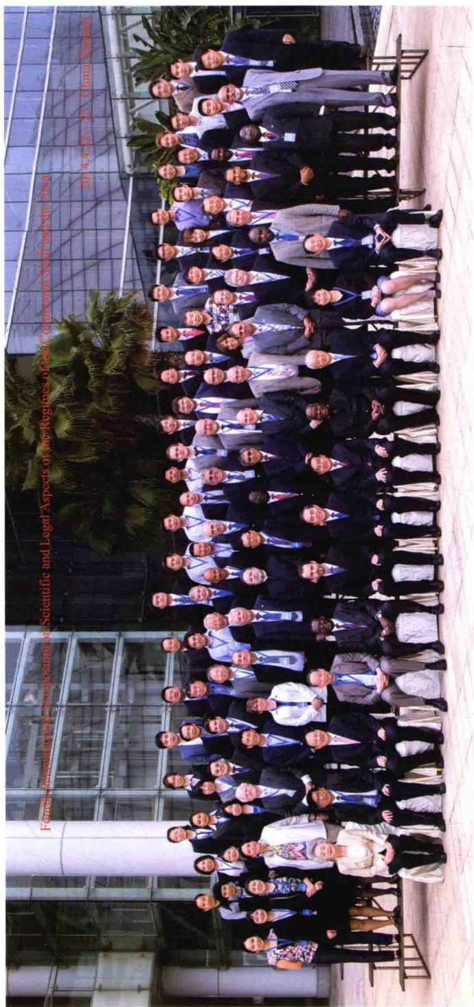
Group Photo of the Symposium Participants, in Xiamen, China, April 22-23, 2014