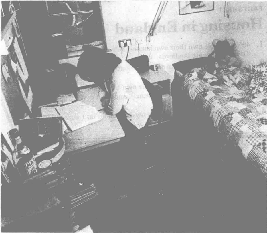
A room in Morrell Hall

What do you think the following words mean? Try to guess them and then look them up to see if you were right.