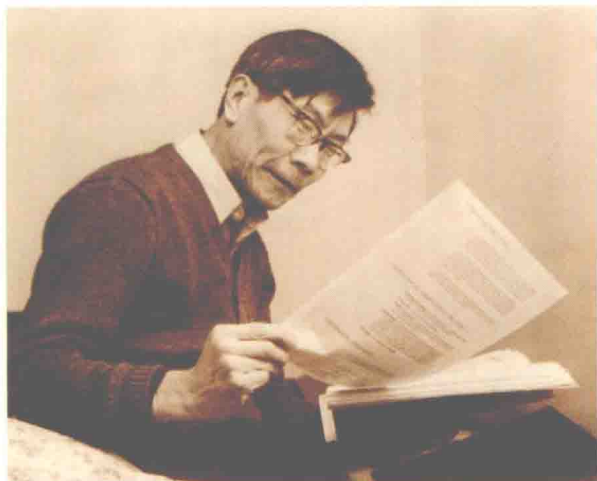
2005-Interviewed with a reporter about himself in newspaper Wenweipo published in Hong Kong.