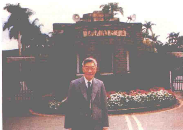
2000-Visited Taiwan and delivered four lectures in different universities