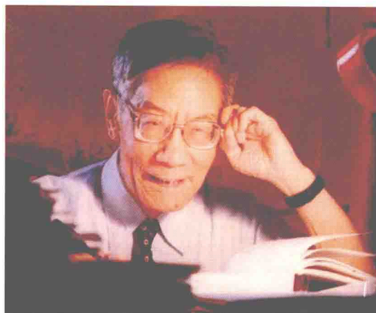
Working in office