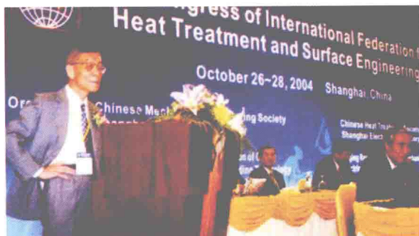
2004-As the Congress Chairman of International Federation for Heat Treatment and Surface Engineering