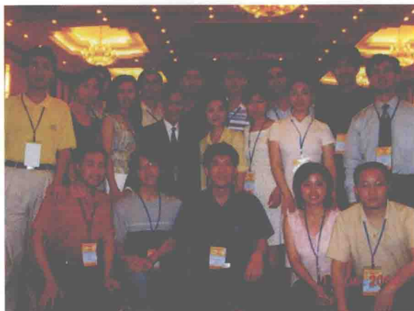
2005-With his partial students and group members at the ICOMAT-05 in Shanghai