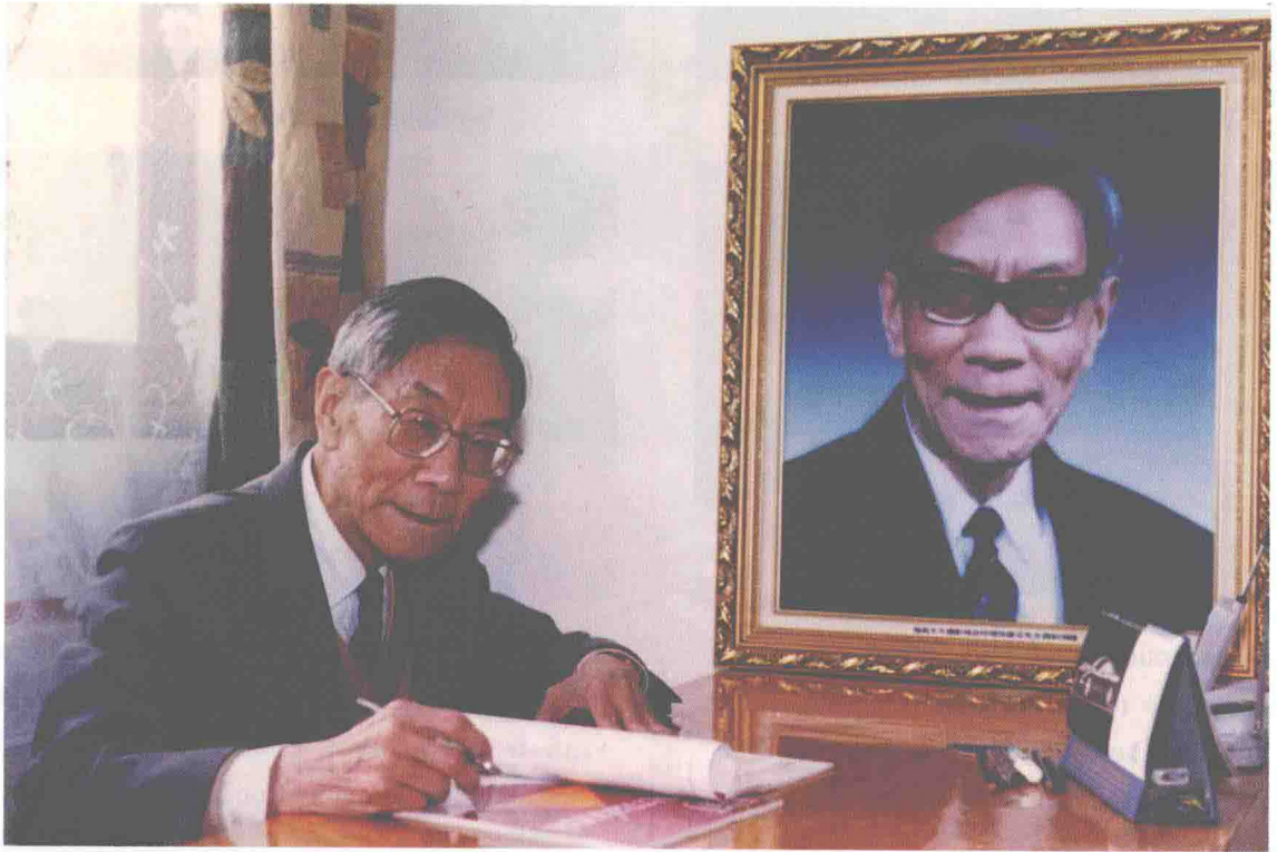
MARCH 2002, IN HIS OFFICE