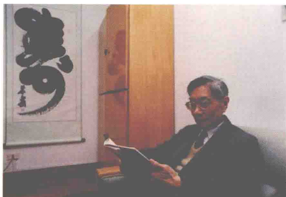
Working in office