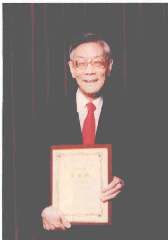
After obtaining the Progress in Science and Technology Prize by the Ho Leung Ho Lee Foundation in 2000