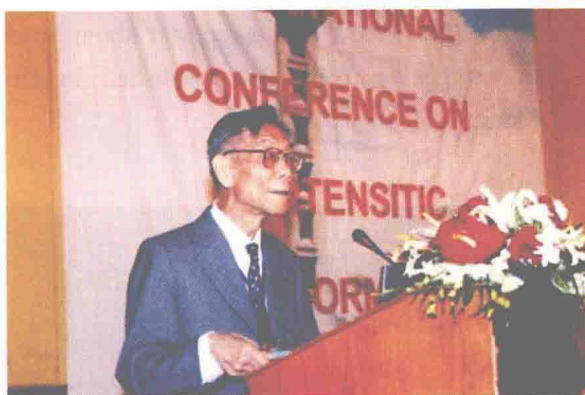
2005-As the Co-Chairman of ICOMAT-05 and delivered plenary lecture in Shanghai