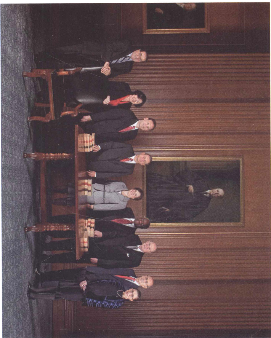
Richard Strauss, Smithsonian Institution, Collection of the Supreme Court of the United States.