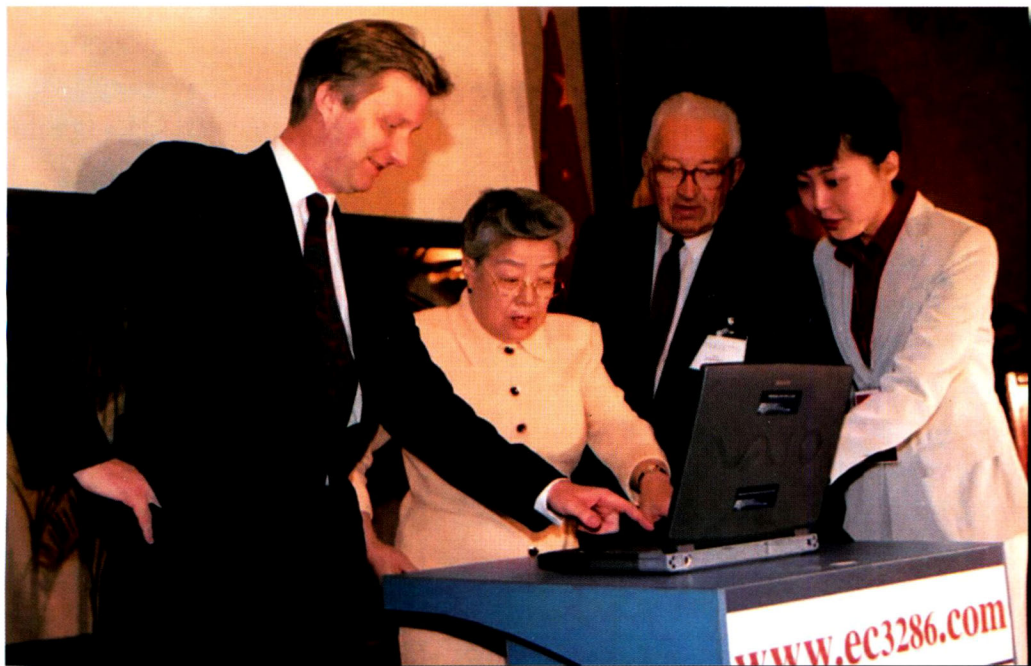
Sino-Belgium Seminar on Port Business was held in Beijing on May 10, 2000. State Councilor Wu Yi and Belgian Prince Philip attended the conference and delivered speeches. At the conference, Prince Philip and Wu Yi pressed the button together to start the operation of Sino-Europe On-line, a professional commerce website newly set up by Sino-Europe Commerce Cooperation Center.