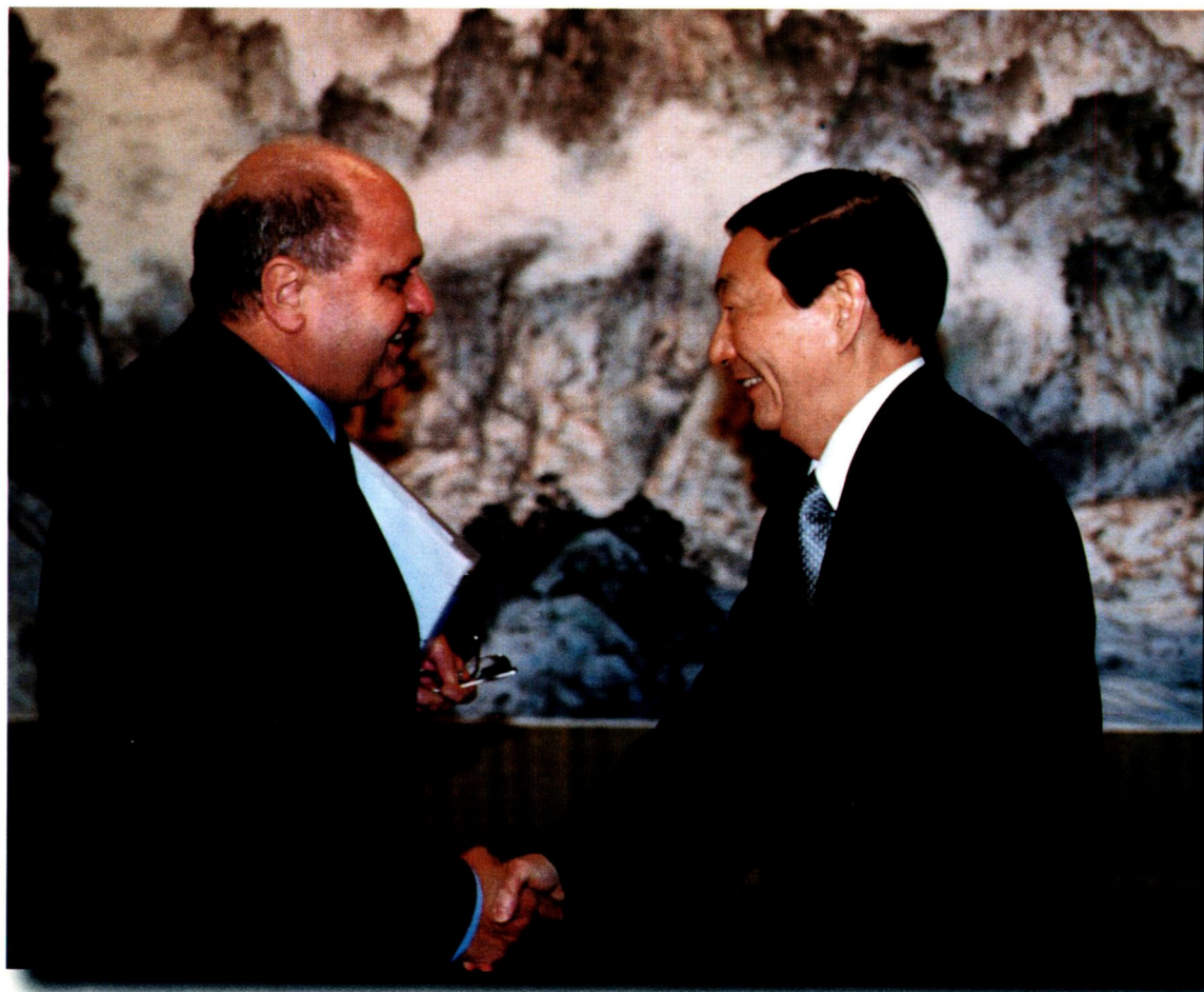
Premier Zhu Rongji met with WTO Director-General Mike Moore in Zhongnanhai, Beijing on February 17, 2000.