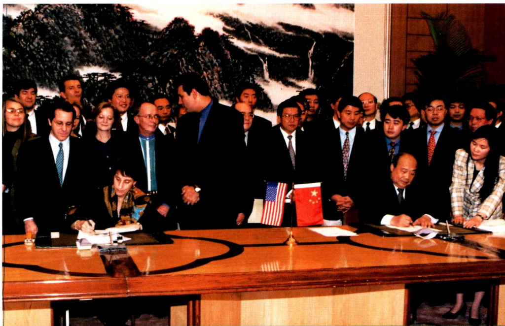
China and the U.S. signed a bilateral agreement upon China's entry into WTO in Beijing on November 15, 1999. Shi Guangsheng, Minister of Foreign Trade and Economic Cooperation and Charlene Barshefsky, the U.S. Trade Representative were signing the agreement.