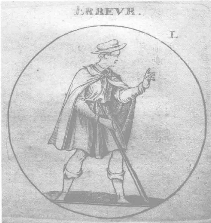
Figure iv Error ( erreur ), from Cesar Ripa, Iconologie ou les principales choses qui peuvent tomber dans la pensee touchant les Vices et les Vertus, sont representes sous diverses figures (Jean Baudoin edn, Paris, 1643) at 59.

allegorical, moral, and spiritual meanings to this depiction of an erring and blind pilgrim. The allegorical meaning is that of the human journey, of the path that we cannot see in the shadow of the valley of death, with merely mortal eyes. Figuratively we are all blind, we are all incapacitated, we are all on a journey, seeking truth and salvation. The allegory is that of the passage from image to an imageless eternity, from darkness to light. This expands into the moral meaning, which is that the senses cannot be trusted, that faith and not sight will direct us to the true path. Common in depictions of justice, blindness here is a species of injunction, both a punishment for being distracted by sight and by the senses, by worldly things, and an exhortation to trust what cannot be seen, what in theological terms has no being and is not, namely divinity.