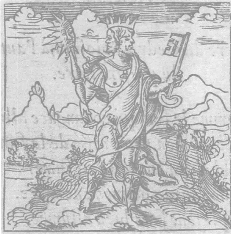
Figure ii Janus, from Guillaume Perrière, Le Théâtre des bons engins (Paris: Janot, 1540) emblem 1.

these early authors place great emphasis on Janus as the guardian of precedent and of the image of law. Whitney uses the motto respice et prospice , look behind and ahead, where Selden refers to public and private, to iconomy and oeconomy, both of which must be looked on, kept under surveillance by a law that penetrates, through vision, into the interior, and so is inscribed on the heart. Perrière uses the additional symbols of sun and key to reinforce this message of visible and invisible.