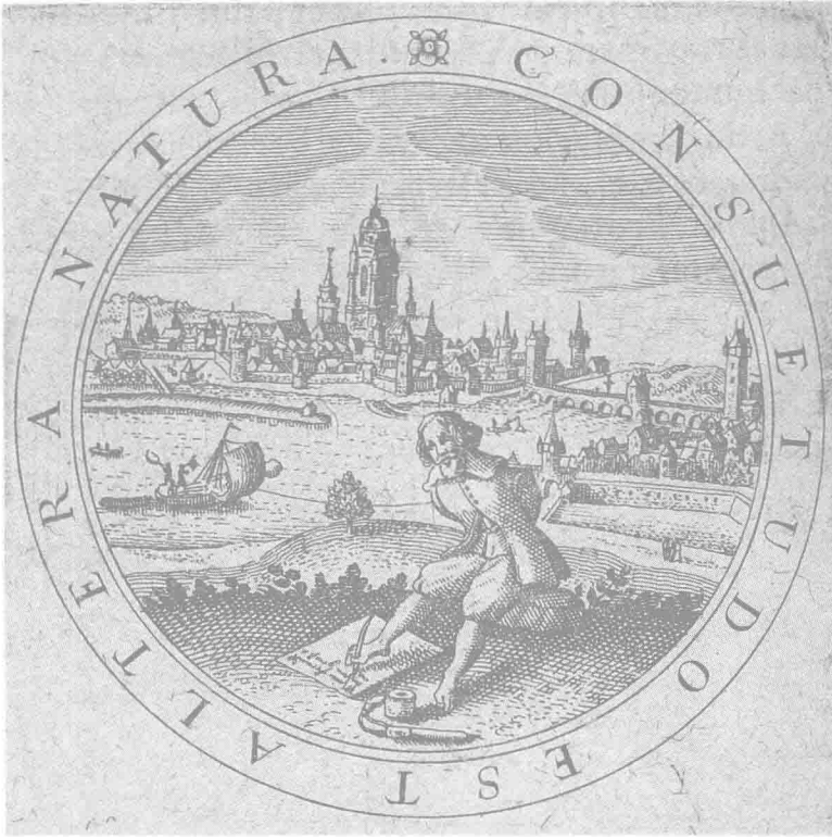
Figure iii Custom as second nature ( consuetudo est altera natura ), from Jacobus Borning, Emblematum ethico-politicorum (Heidelberg: Bourgeat, 1654) emblem 45.

jurisprudence if we appreciate properly that the emblem shows another quill awaiting the writing of the left foot.