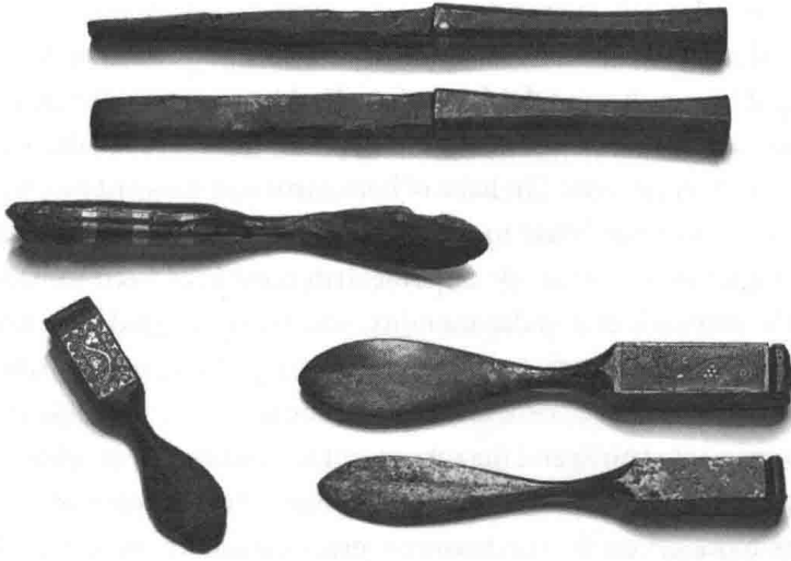
A set of surgical instruments has been found in the Great Baths of the civil Roman town Colonia Ulpia Traiana (close to Vetera castra).

tem toward its authoritative figures; the nature of their authority; the means of disseminating medical information, techniques, and practices; and the characteristics of the interaction between patient and healer. To begin, the first two chapters of the book focus on the identification of medical authority during the High Roman Empire, from both an institutional and the patients' point of view. Chapter 1 charts the establishment of medicine as a profession in Rome and then details how it functioned during the High Empire. Chapter 2 then considers patients' understandings of medical authority, with particular reference to the relationship between temple and scientific medicine.