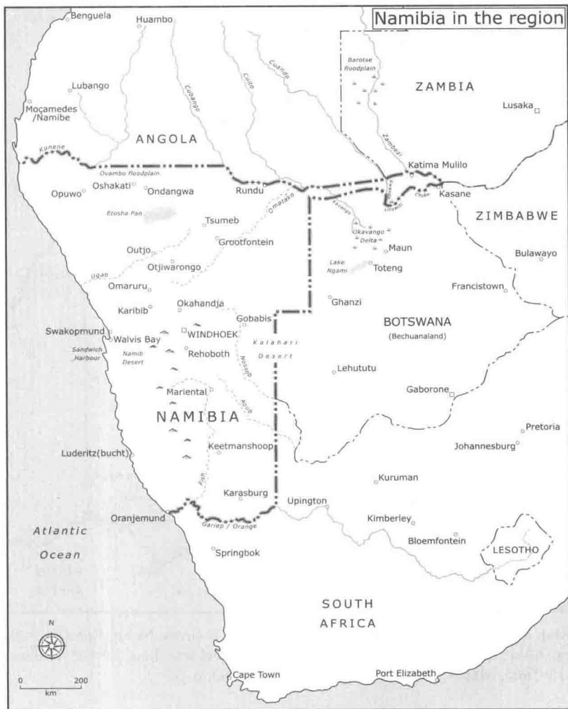
Map 1: Namibia in the region (© Sebastian Ballard).

Note: With the exception of Map 5, these maps do not relate to a particular period in Namibia's history.