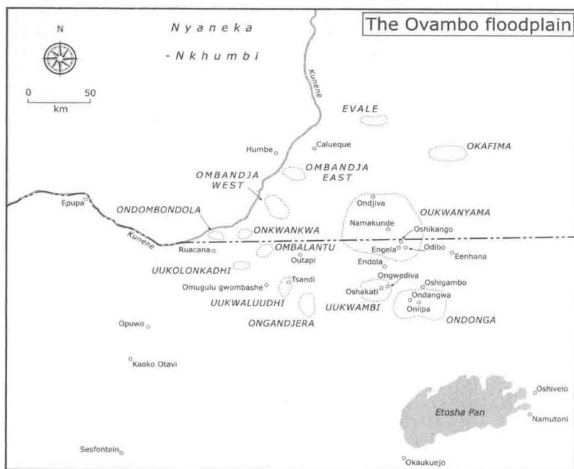
Map 4: Inset of Map 3 (overleaf), the Ovambo floodplain (© Sebastian Ballard). This map shows places mentioned in the text, rather than the Ovambo floodplain at any particular period. The international border shown here is the modern one; before 1928 the Neutral Zone lay to its south. The map shows, approximately , the location of the Ovambo polities in the nineteenth century; Oukwanyama is also shown extending some distance into Namibia, as it certainly did by the early twentieth century. It should be noted that the borders of the polities changed over time, in some cases markedly, and that, during the twentieth century, the forest zones between them were needed for settlement. Some places now falling within these states may therefore be shown outside them on this map. In addition, some modern foundations, such as Oshakati, are also shown. Sources: McKittrick, To Dwell Secure , Map 2.1; Hayes et al. , Namibia under South African Rule , p. xviii; Kreike, Recreating Eden , Map 4.