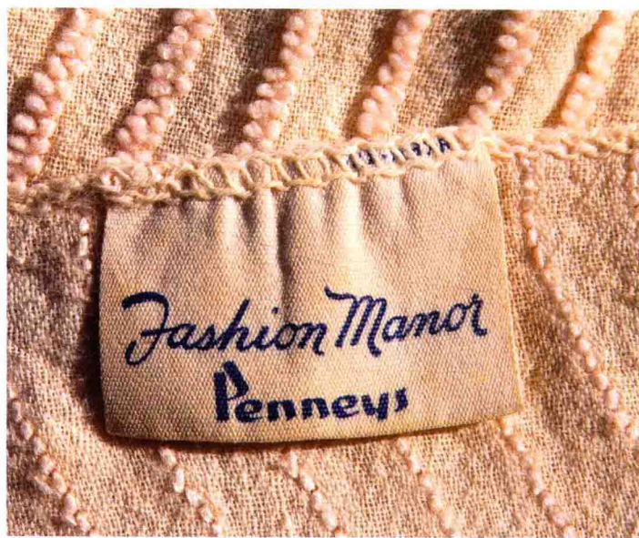
Fashion Manor Penneys