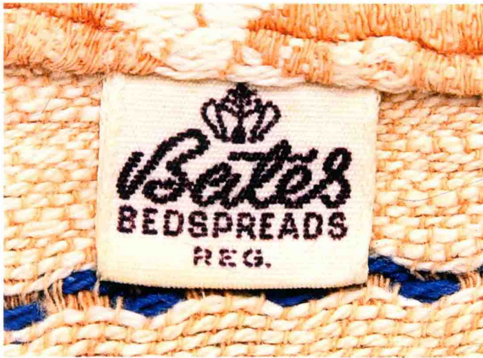
Bates BEDSPREADS REG.