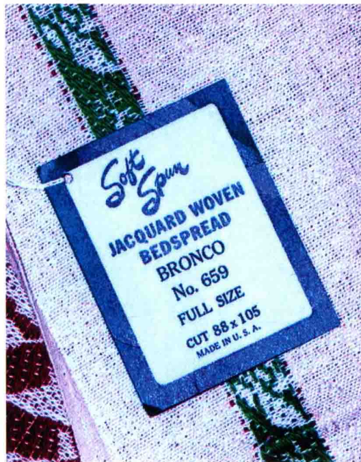
Soft Spun JACQUARD WOVEN BEDSPREAD BRONCO NO. 659 FULL SIZE CUT 88 X 105 MADE IN U.S.A.