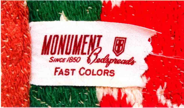
MONUMENT Bedspreads Since 1850 Fast Colors