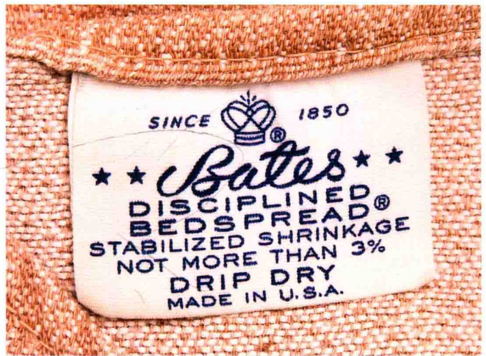
SINCE 1850 ** Bates ** DISCIPLINED BEDSPREAD® STABILIZED SHRINKAGE NOT MORE THAN 3% DRIP DRY MADE IN U. S. A.