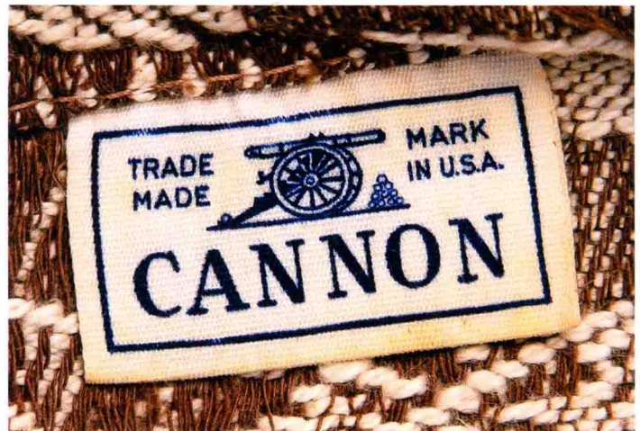
TRADE MARK MADE IN U.S.A. CANNON