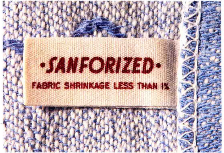
- SANFORIZED - FABRIC SHRINKAGE LESS THAN 1%