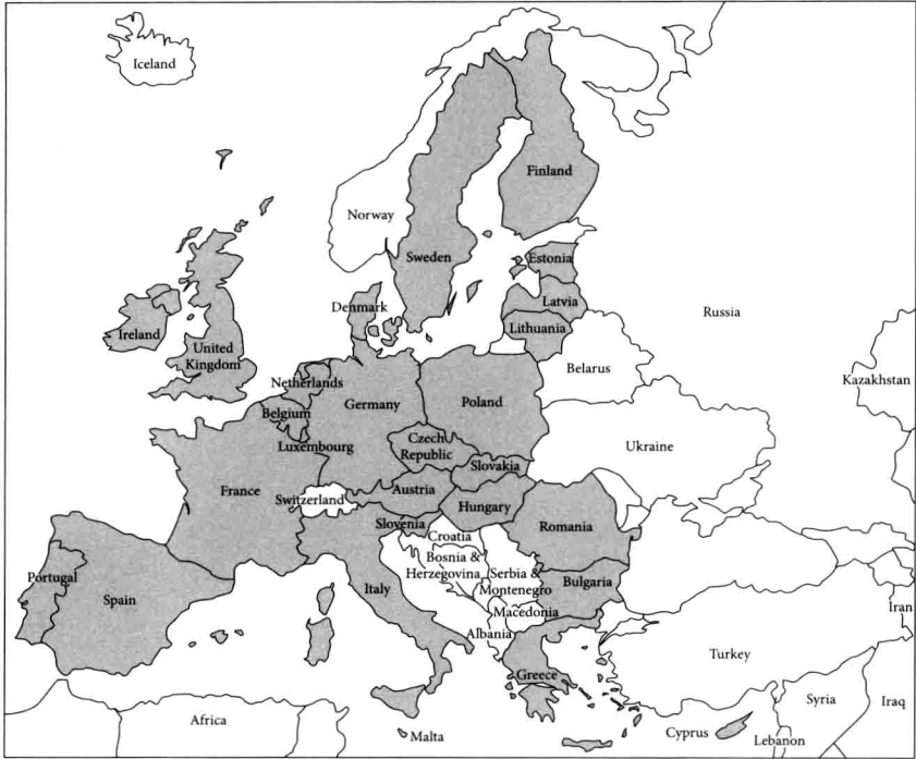
Map 2 The European Union.