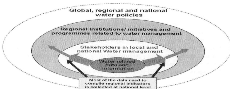
Figure 2. Multi-scale stakeholders in the water information system.