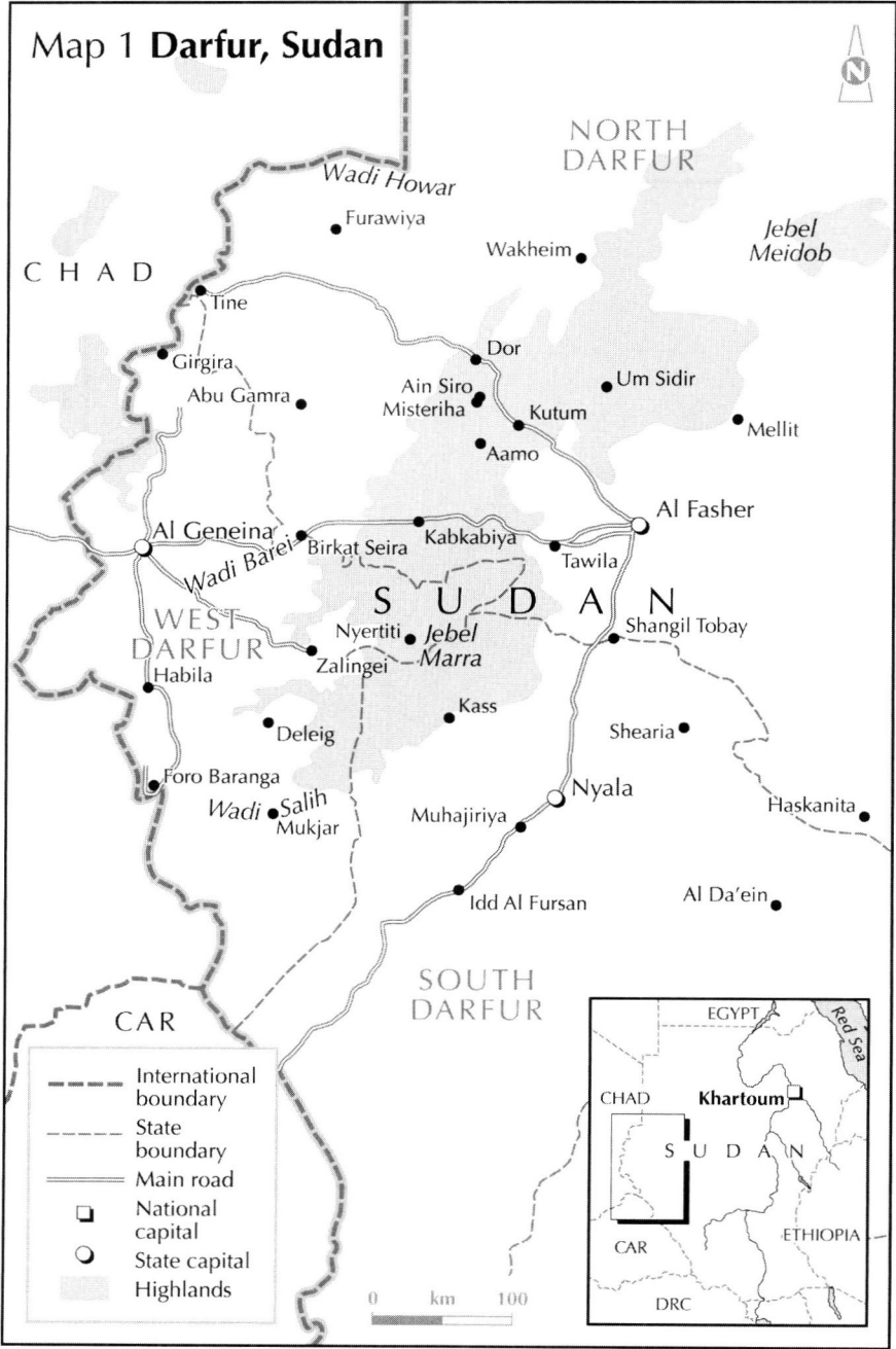
Map 2 Detailed map of Darfur.