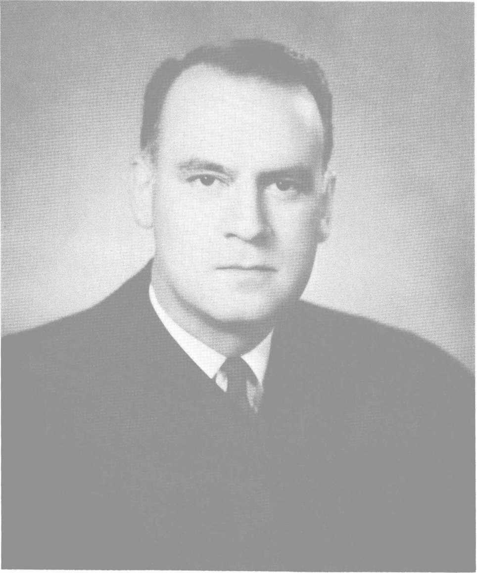
HON. POTTER STEWART