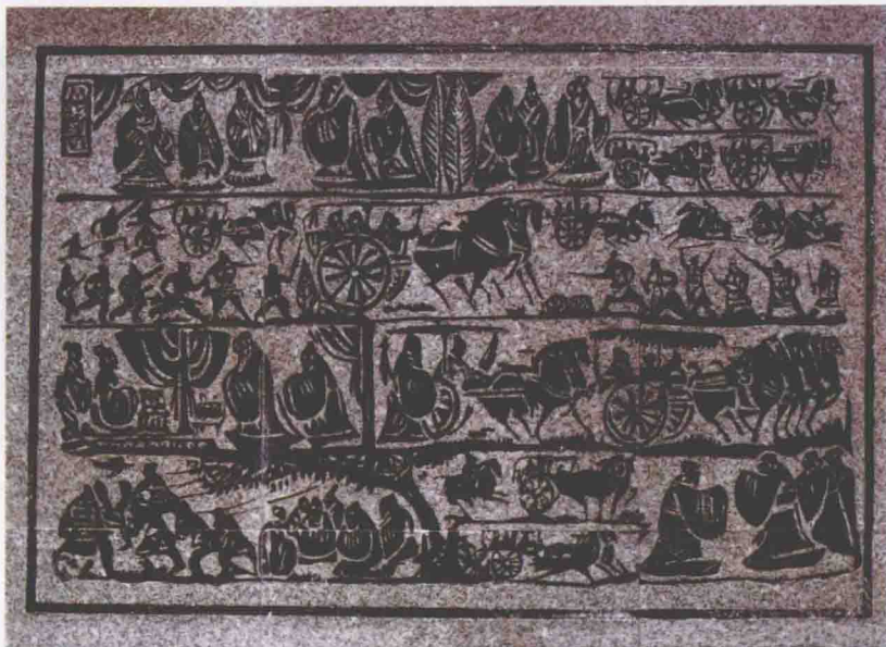
A wall carving depicting Confucius' visits to various kingdoms.

Another of the emperor's grandiose projects