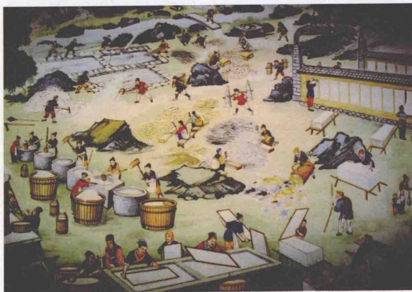
An early papermaking workshop.

The Sui dynasty unified China in AD 581 after more than 400 years of disunity, yet it only lasted 38 years. Much was accomplished during this dynasty's short reign – a population census, reformation of the bloated regional administration system and consolidation of the southern regions. One of the Sui's most important legacies was building the Grand Canal ( dà yùnhé 大运河) which linked Hangzhou in the south to Beijing in the north. The network of canals aided and enhanced economic and cultural exchange between the south and north and would greatly influence China's development. The downfall of the Sui dynasty came with several military excursions into Korea. These disastrous wars were prohibitively expensive and brought the dynasty to bankruptcy. Peasant rebellions erupted throughout the countryside and Li Yuan, a Sui government minister, ended the Sui dynasty when he founded the Tang dynasty.