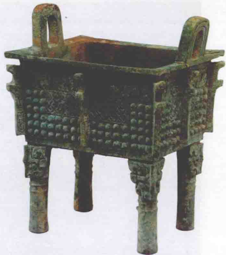
Bronze ding vessels were an important part of early Chinese rituals.

Enter Confucius, China's most influential teacher and philosopher who lived from 551 to 479 BC, during one of China's most turbulent periods. This was a transitional