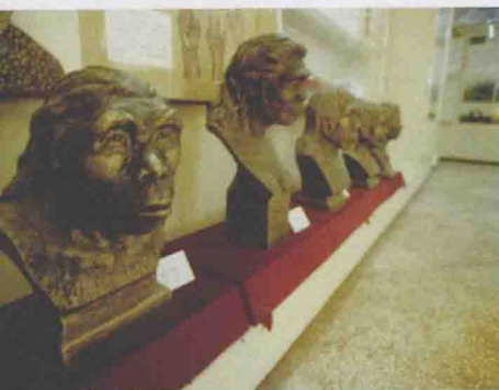
Over 1.7 million years ago the early ancestors of humans roamed through China.