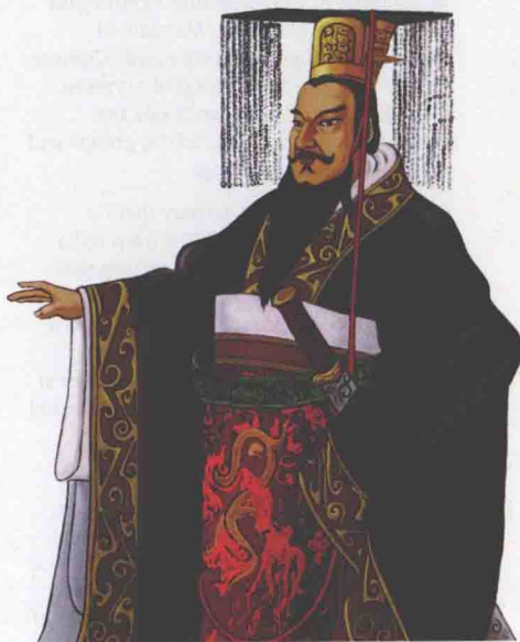
The first emperor of a united China, Qin Shihuang.

Under the Eastern Han dynasty, power was further centralized, the economy continued to prosper and cultural achievements reached a peak – this era is considered one of China's golden ages. Paper was also invented during this time. Although samples of paper have been found dating back to the Western Han, it was during the Eastern Han when improved papermaking techniques made it practical to manufacture. With the discovery of paper, the dissemination of information and spread of learning increased China's cultural influence.