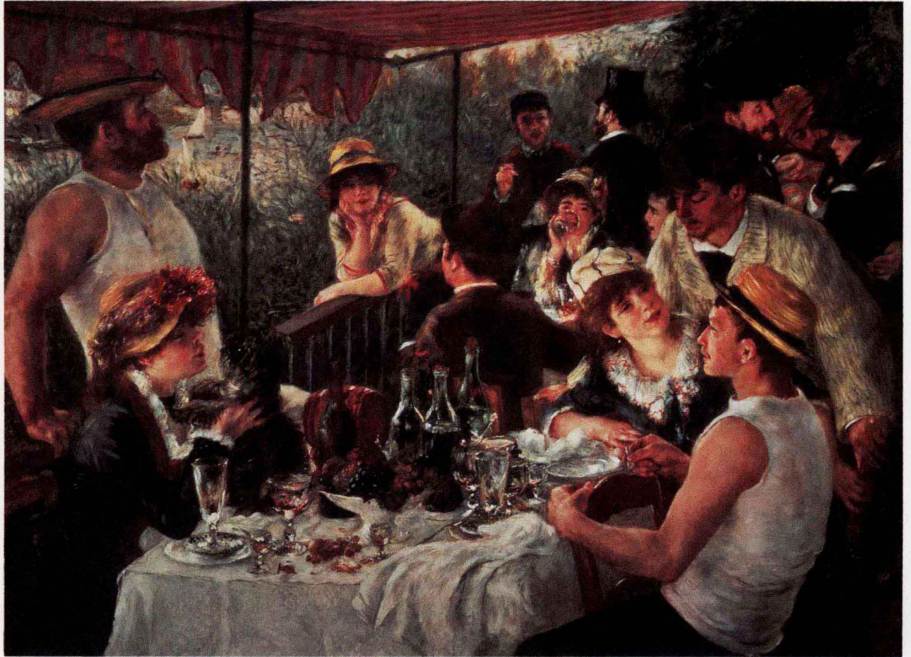
Renoir, The Luncheon of the Boating Party . Washington, D.C. Phillips Collection (9795)/Bridgeman/Art Resource, New York.