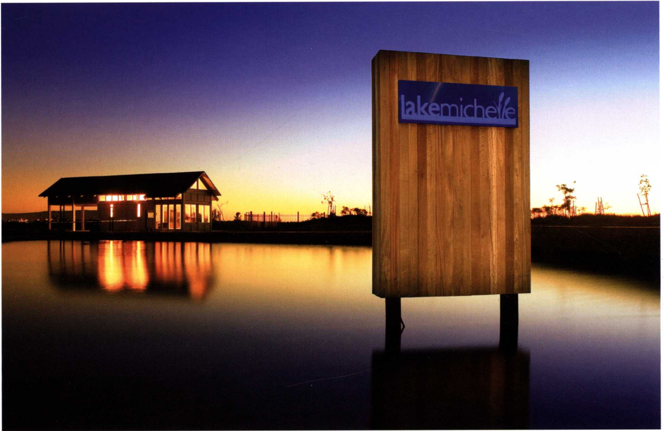
Top: The site is entered across a pond which introduces the water theme. Bottom: Jetties provide access to the lake for water sport. Right: Hardwood, indigenous grass and other permeable surfaces.