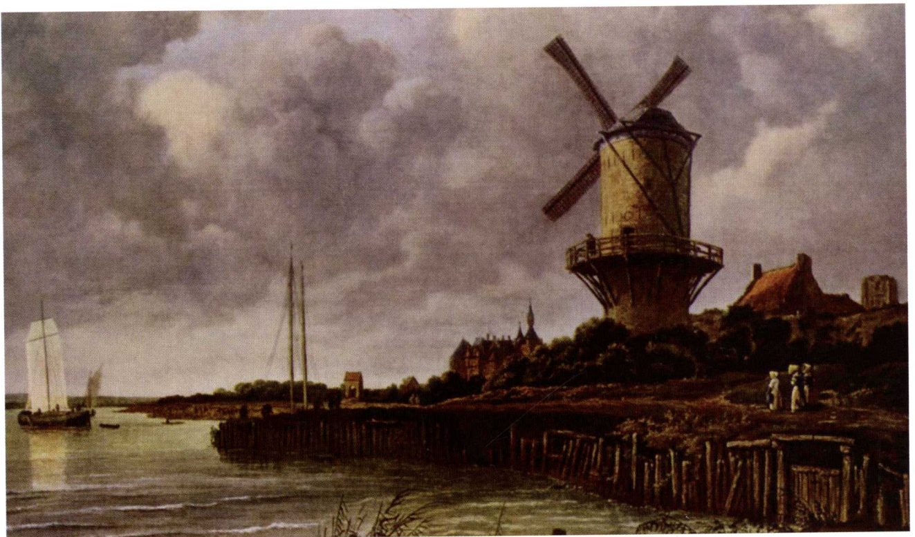
Jacob Isaacksz. van Ruisdael: Mill at Wijk at Duurstede, 1670 (Detail).

This volume presents the most diverse forms of water that appears in landscape architecture. In addition to large landscape designs there are waterfalls, and fountains emerging from the pavement, without any trace of green, water surfaces with rigorous contours, rainwater diverted from the roof and even planned puddles. It shows how water caresses, contradicts or continues the architecture, how it creates calm or excitement, attracting the attention of the visitors or guiding them along their way. Water – with some of these buildings it can be a very small amount – is one of the most decisive elements of these designs.