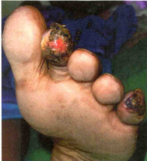
Fig. 3. Showing ulcers on second and fifth toes due to rat bite

Certain atypical presentations are seen because of socio economic and cultural factors prevalent in India. Patients with neuropathy and consequent loss of protective sensations, who sleep on the floor are invariably bitten by house rats who nibble toes creating deep foot ulcerations. Patients notice the ulcers on waking up to find blood stained bed linen, in the morning. Patients notice the ulcers on waking up to find blood stained bed linen, in the morning.