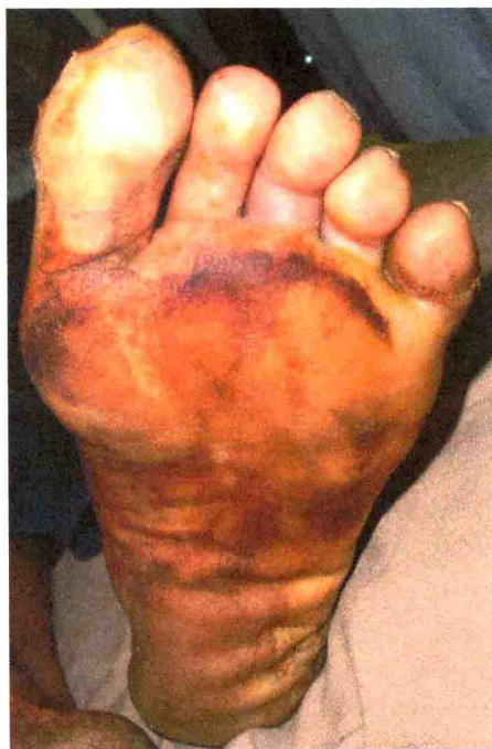
Fig. 4. Showing thermal injury on the plantar area of right foot.

Indians are known for sitting cross legged for long hours at work and during worship. Repeated and prolonged pressure over lateral malleolar areas lead to formation of bursae. Such bursae over lateral malleoli are dark and hypertrophied but are usually harmless in non neuropathic individuals. In diabetics with neuropathy, these bursae get ulcerated and often secondarily infected, creating a surgical emergency. Indian women wear metal (silver being commonest) toe rings in one or more toes of both feet, which is part of tradition. In neuropathic feet with deformities of toes, these toe rings often cause strangulation in presence of swelling of the feet. In tropical climate due to excessive sweating, fungal infection quickly sets-in, in web spaces. In diabetics with neuropathy these macerated ulceration often gets secondarily infected and find their way, quickly, to deep plantar compartments creating a limb threatening situation. (Pendsey 2010).