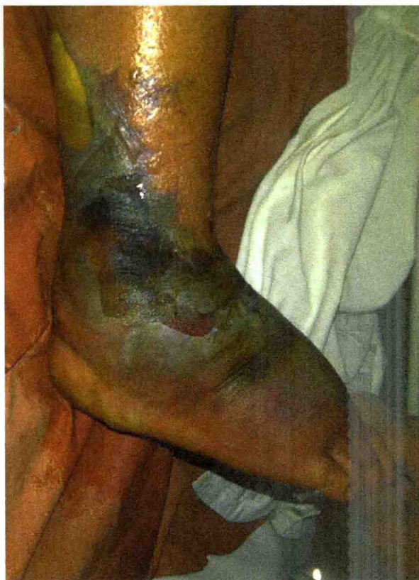
Fig. 1. Severely infected foot

Peripheral vascular disease (PVD) has been reported to be low among Asians (Pendsey 1998) ranging between 3 – 6% as against 25 – 45% in Western world. (Marinelli et al.,1979; Migdalis et al., 1992; Walters et al., 1992). The prevalence of PVD increases with advancing age and is 3.2% below 50 years of age and rises to 55% in those above 80 years of age. Similarly it also increases with increased duration of diabetes, 15% at 10 years and 45% after 40 years (Janka,et al., 1980). In India the number of diabetic patients above the age of 80 years or with the duration of diabetes of more than 30 years is extremely low, thus explaining the low prevalence of PVD in Indian diabetics. (Pendsey 1998).