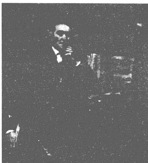
John Hunter (1728–1793)

The work of Harvey and Willis was subsequently complemented by the discovery of the capillary system by Malpighi (1661) and this paved the way for modern theories regarding the evolution and pathology of AVMs.