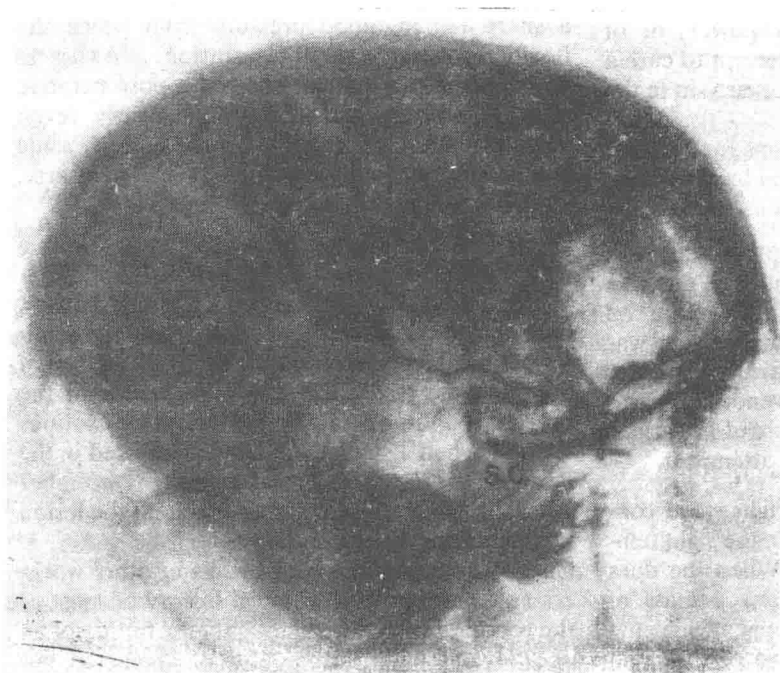
Left carotid angiogram showing a frontoparietal AVM. In the monograph of Egas Moniz, "L'Angiographie Cérébrale" Masson, Paris 1934.

Olivecrona had a disappointing experience in 1923 when exploring for an infratentorial tumor (case 65). He was confronted with a highly vascular AVM and the patient died. In another case (66),