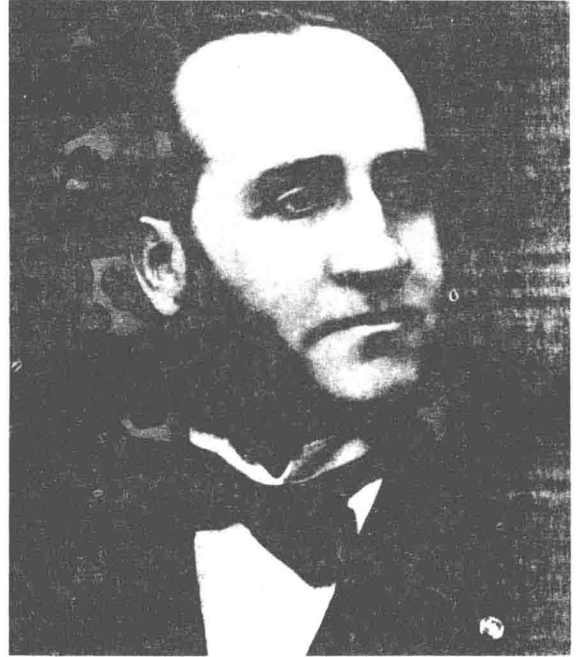
Jules Emile Péan (1830–1898)