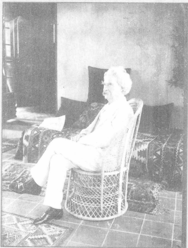
Circa 1900: American writer and humourist Samuel Langhorne Clemens (1835 – 1910) whose pseudonym Mark Twain means two fathoms deep. His most famous work is The Adventures Of Huckleberry Finn (1884).