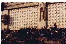
Studenti in Piazza 4 Novembre, a Perugia

1 In... in the middle 2 Forest 3 Capital 4 Learn 5 Peace 6 Do you want to go to Assisi? 7 Blow 8 North wind 9 Earthquake 10 Can you 11 Admire 12 University 13 More than 14 Countries