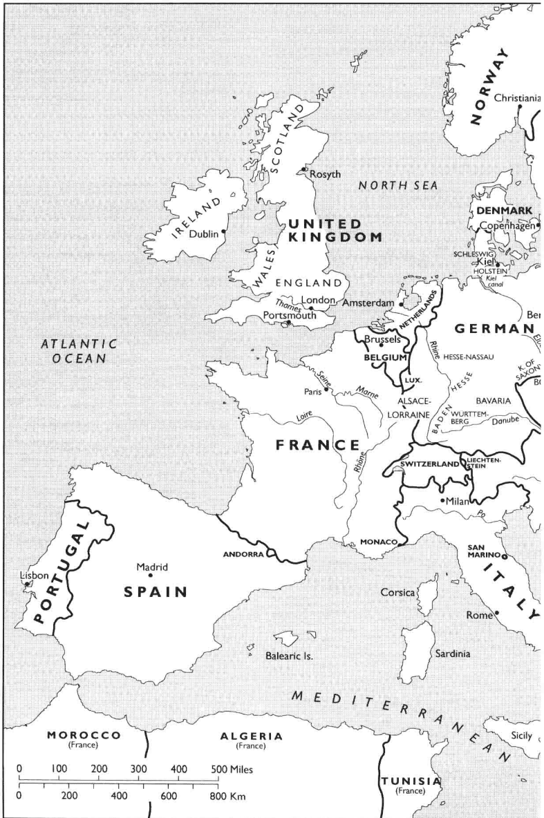
1 Europe before the war