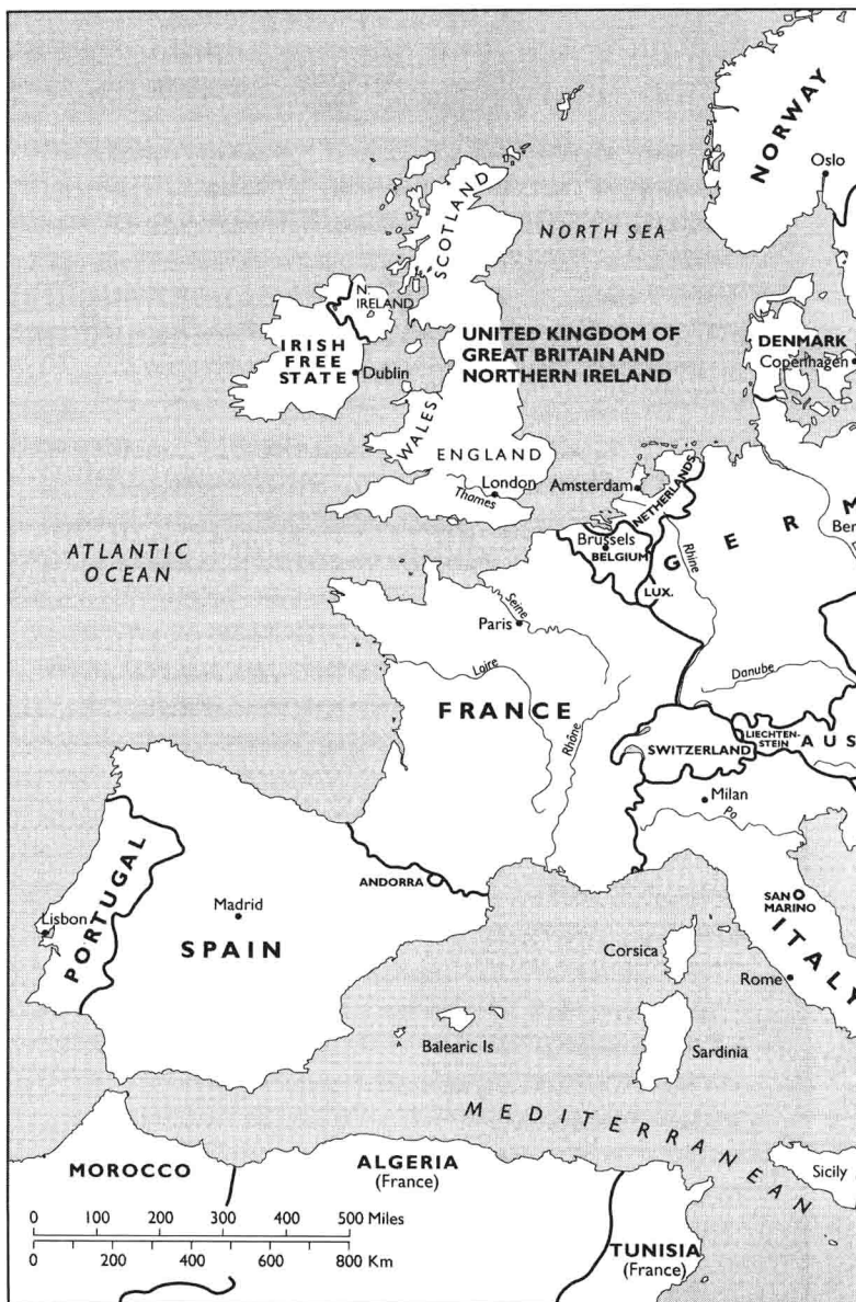
2 Europe after the war