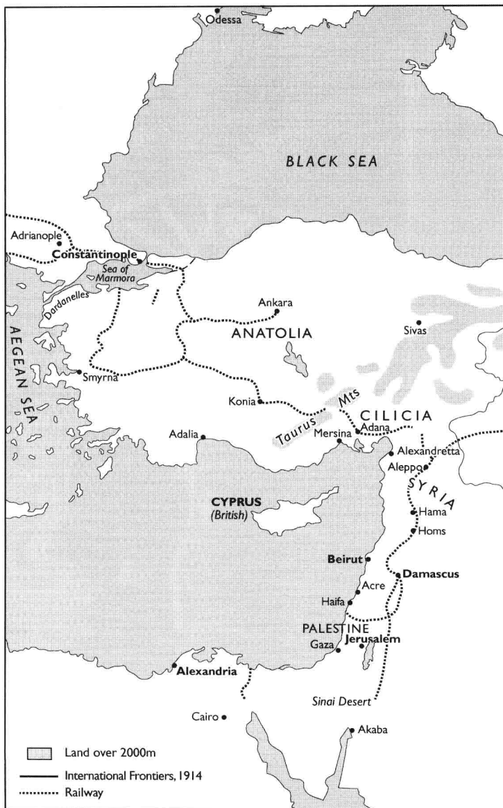
7 The Ottoman Empire