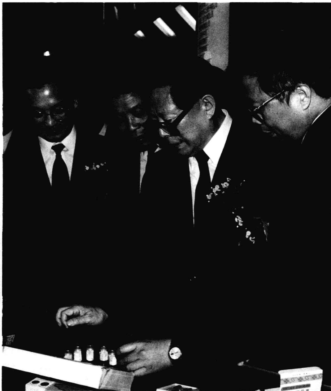
1. President Jiang Zemin visits the Traditional Chinese Medicine booth at the 2nd National Enterprise and Technology Development Fair.