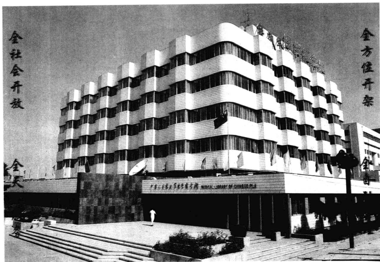
17. The Medical Library of the People's Liberation Army.