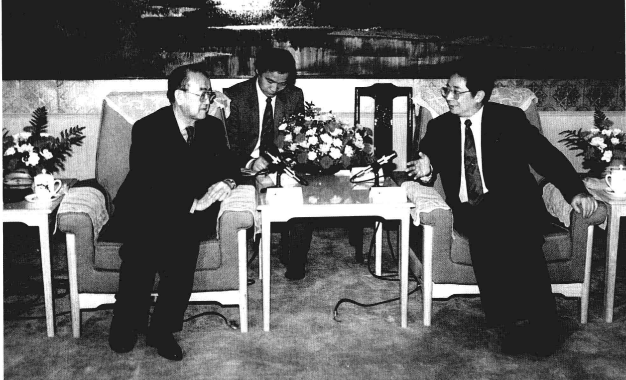
15. Chen Mingyi, Governor of Fujian Province, meeting Dr. Hiroshi Nakajima, WHO Director-General on 4 April 1995 in Fuzhou City.