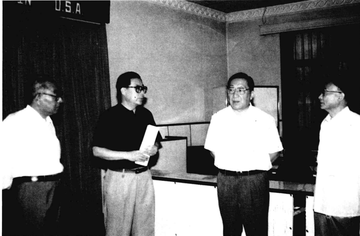
3. Vice Premier Li Lanqing inspects the Harbin Medical University in Heilongjiang Province.