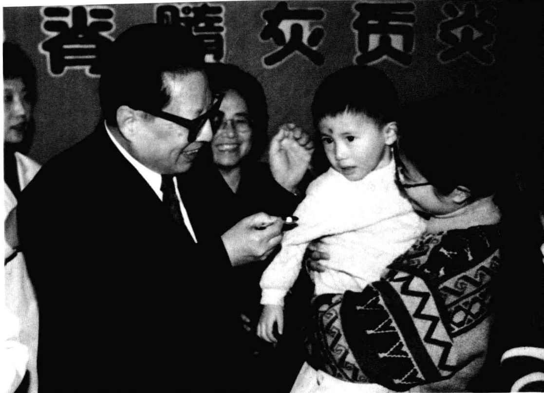
2. On December 5 1995, the third National Immunization Day for eradicating poliomyelitis. Qiao Shi, Chairman of the Standing Committee of NPC (Fig. A) and State Councilor Peng Peiyun (Fig. B) feed the poliomyelitis vaccines to children in Beijing.