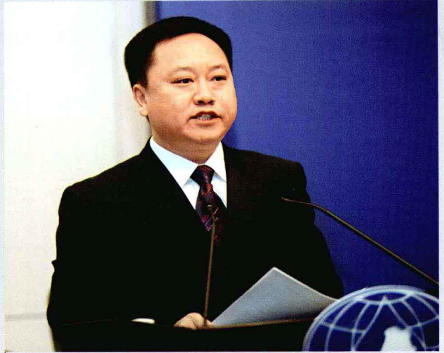
Li Guoying, Professor, Commissioner of the Yellow River Conservancy Commission