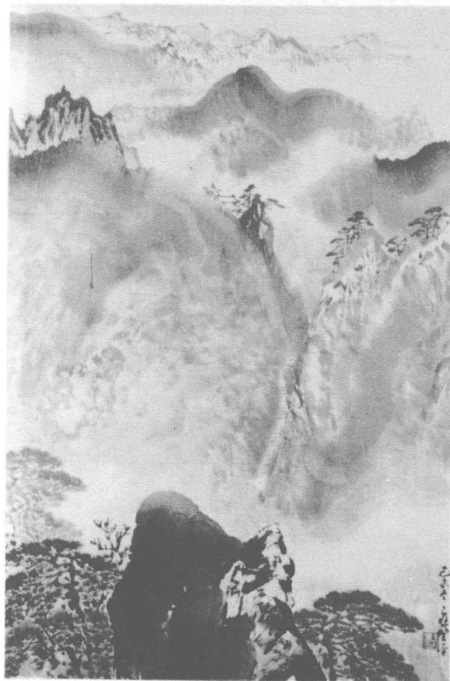
应野平 YING YEPING 山水 LANDSCAPE