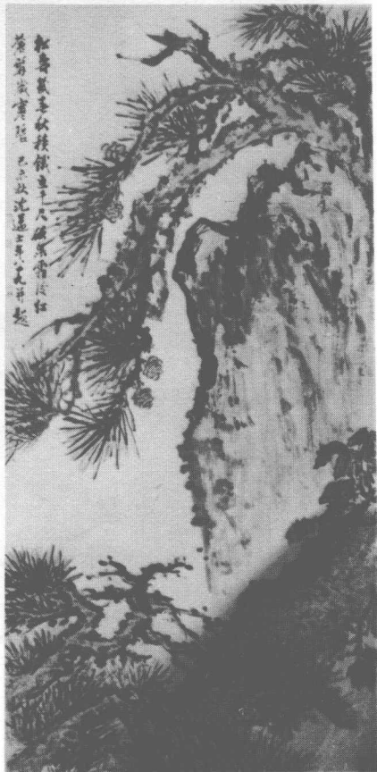
沈迈士 SHEN MAISHI 松石 PINES AND ROCKS