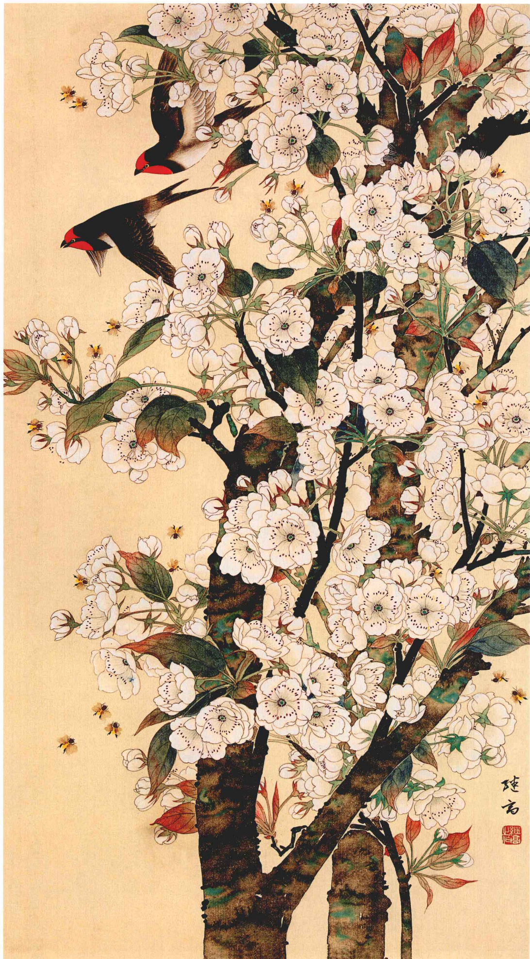
梨花春燕 Spring Swallows in Pear Rain 78cm × 43cm 1978年