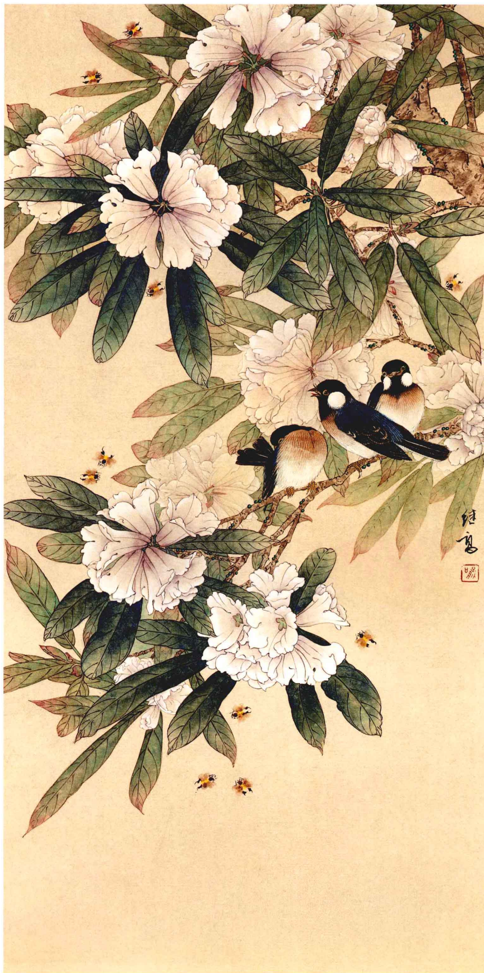
杜鹃山雀 Cuckoo and Tit 68cm × 34cm 1978年