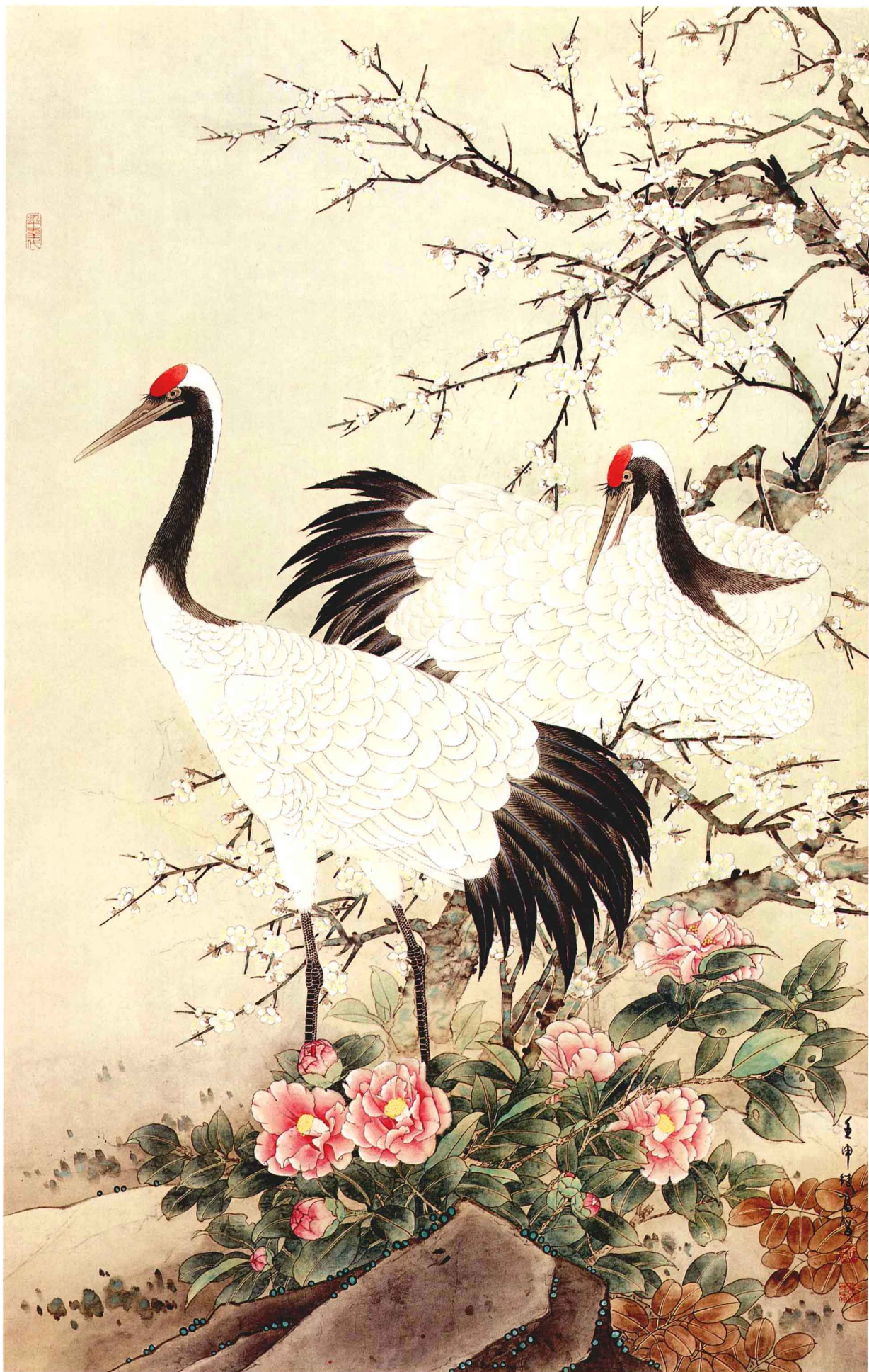
双鹤沐春 Twin Crane in Spring Sunshine 172cm × 95cm 1992年