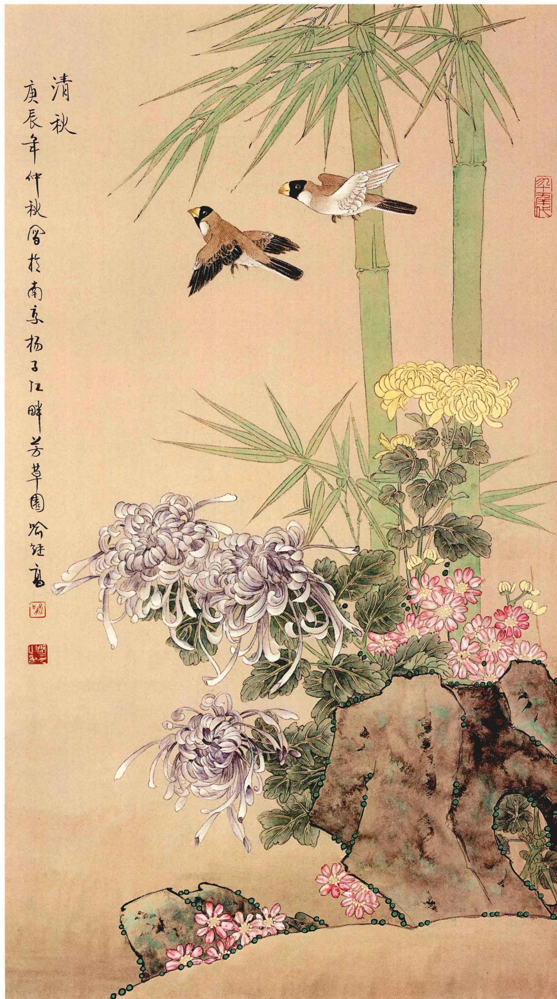
清秋 Light Autumn 92cm × 51cm 2000年