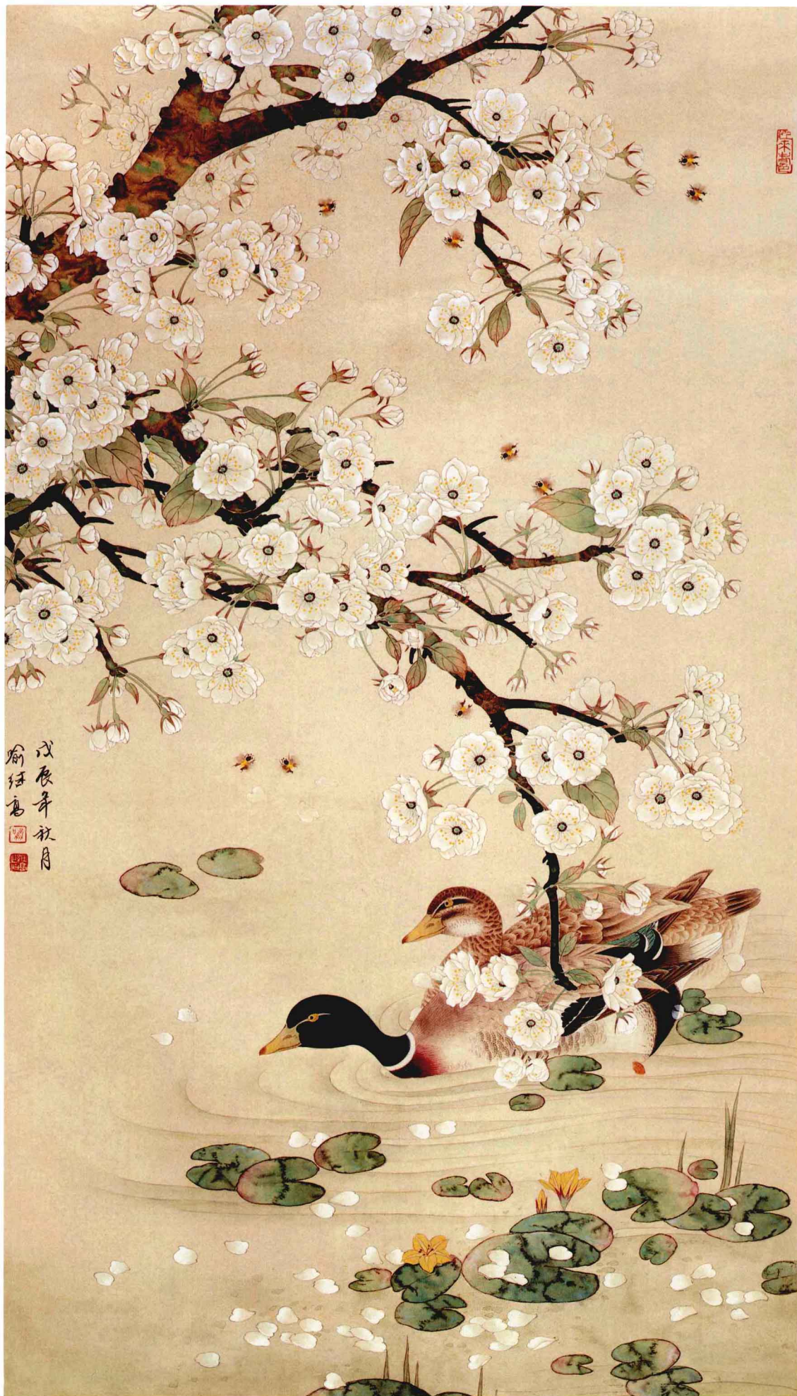
春江水暖 River in Warm Spring 136cm × 66cm 1988年