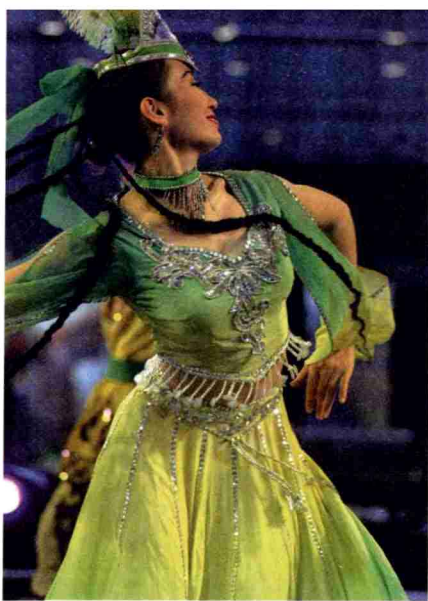
• 哈萨克族女子 A Kazak woman

料多为牲畜皮毛，保暖性强，厚实庄重；而生活在气候炎热、潮湿多雨的南方地区的少数民族大都种植棉麻，服装材料也多是自织的麻布和土布，且样式短窄轻薄。