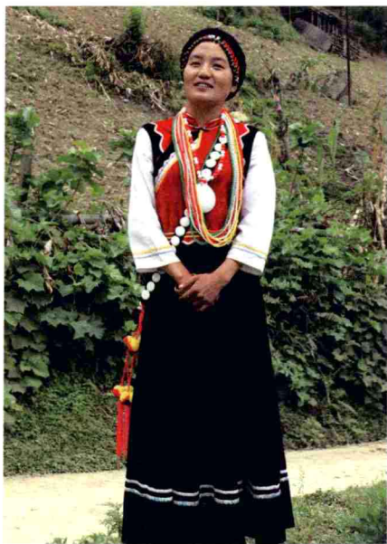
• 怒族女子 A Nu woman