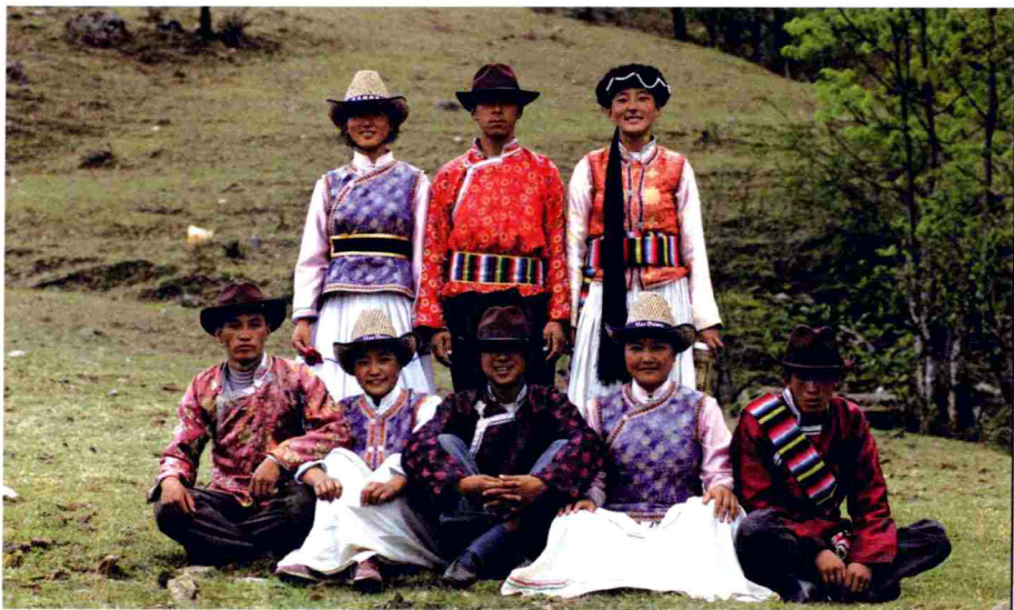
• 普米族男女 Primi men and women

There's great difference in natural environment and terrain between China's south and China's north, thus the costume and accessories present unique local feature. In northern cold areas lives Tibetan, Mongolian, Kazakh who have