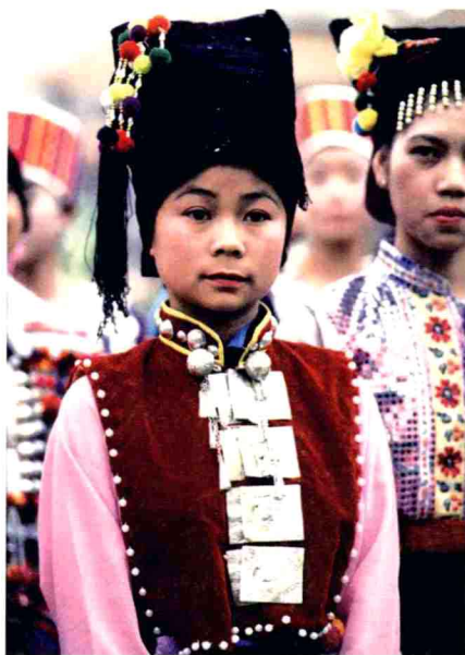
• 阿昌族女子 Achang women