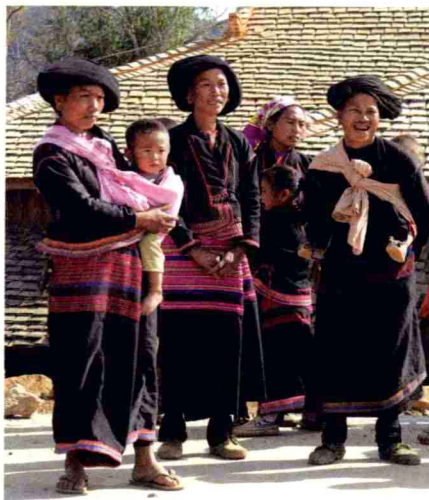
• 傈僳族妇女儿童 Lisu women and children