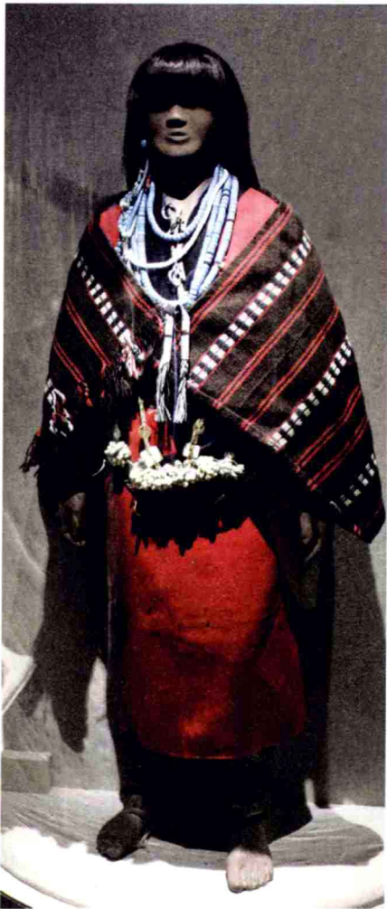
• 珞巴族毛织女服 Lhoba women's wool weaving dress

been engaging in animal husbandry. Their clothing material has to be warm and strong enough, therefore, animal fur is used as the main clothing material.