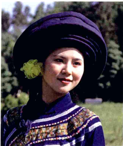
• 水族女子 A Shui woman