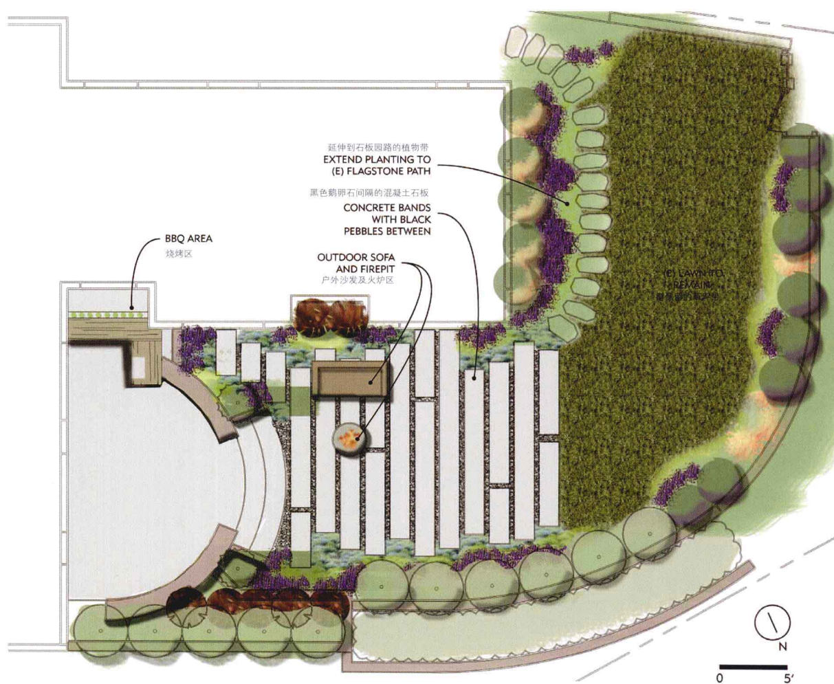
Garden Plan 总平面图