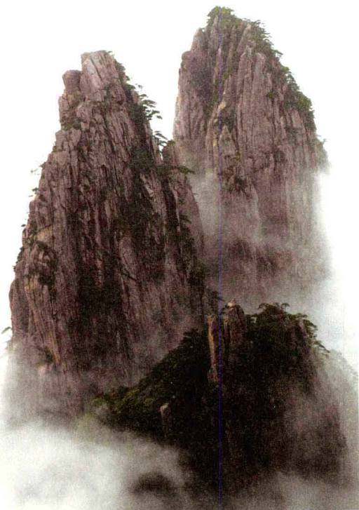
• 黄山风光 Mount Huang Scenery

黄山素有“中国第一奇山”之誉，山脉自东北向西南绵延250公里，山势险峻，境内呈峰林地貌，千峰万岭，峥嵘嶙峋，其中有名可