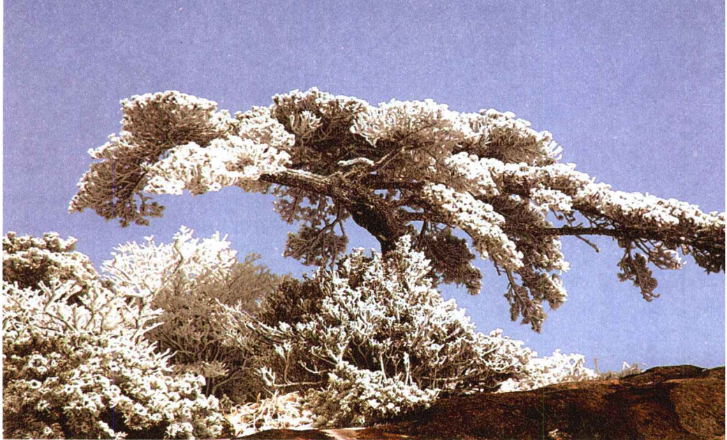
• 冬季的黄山松 Mount Huang Pine in Winter

的美。人们根据它们不同的形态和神韵，分别起了贴切自然而又典雅有趣的名字，如迎客松、黑虎松、探海松、团结松等等。黄山松以坚硬的花岗岩石为壤，或迎风挺立于峰顶，或悬于悬崖峭壁，或隐于深壑幽谷，郁郁葱葱，焕发出无限的生机，与黄山奇特的自然景观相映成趣，形成了“无峰不石，无石不松，无松不奇”的秀丽景色。