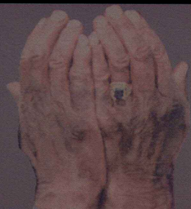
天山行组画之二 A Trip to Tian Shan Mountains 1994 62x48cm