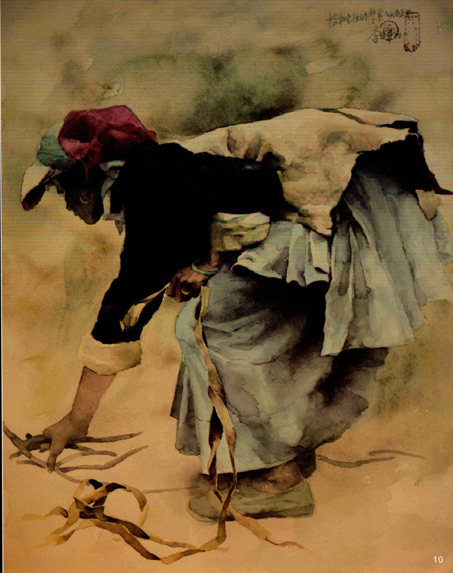
捡树枝的摩梭妇女 Red Scarf & Red Skirt 1995 62x48cm