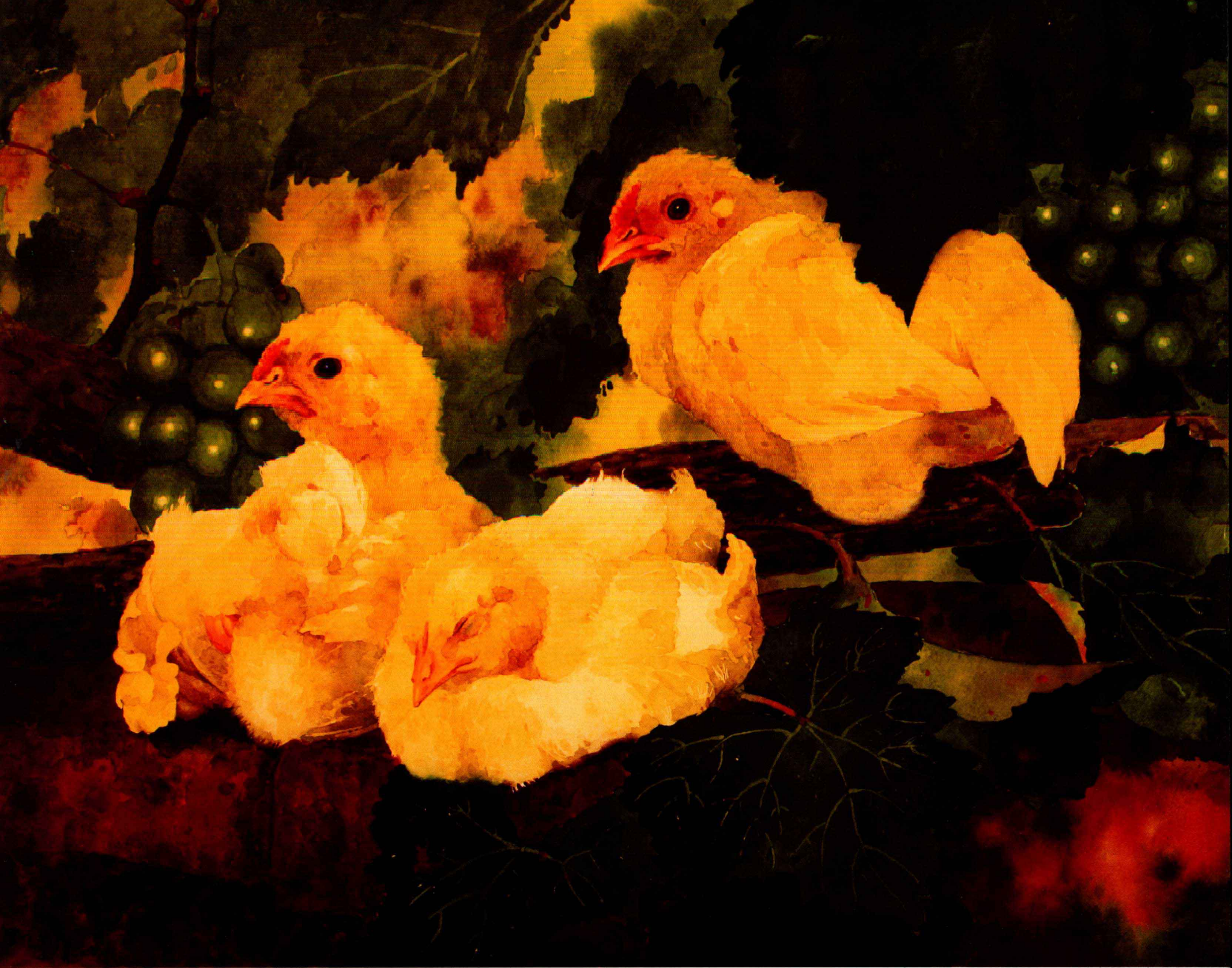
葡萄架下 Under The Grapevine 2004 6 3. 2*48. 8