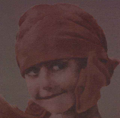
红头巾红裙子 Red Scarf & Red Skirt 62x48cm 1995