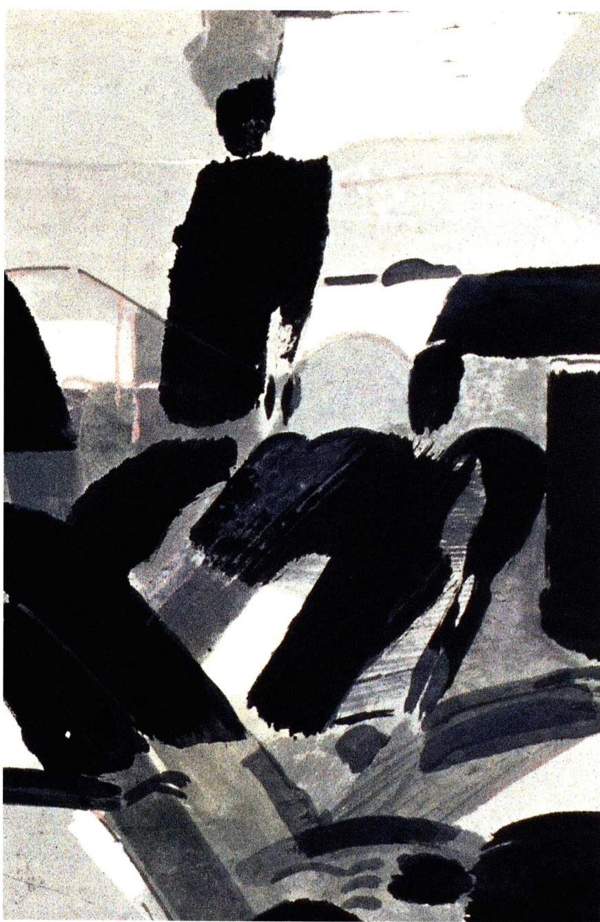
POLO · 马球 · 2000 (局部 Part)