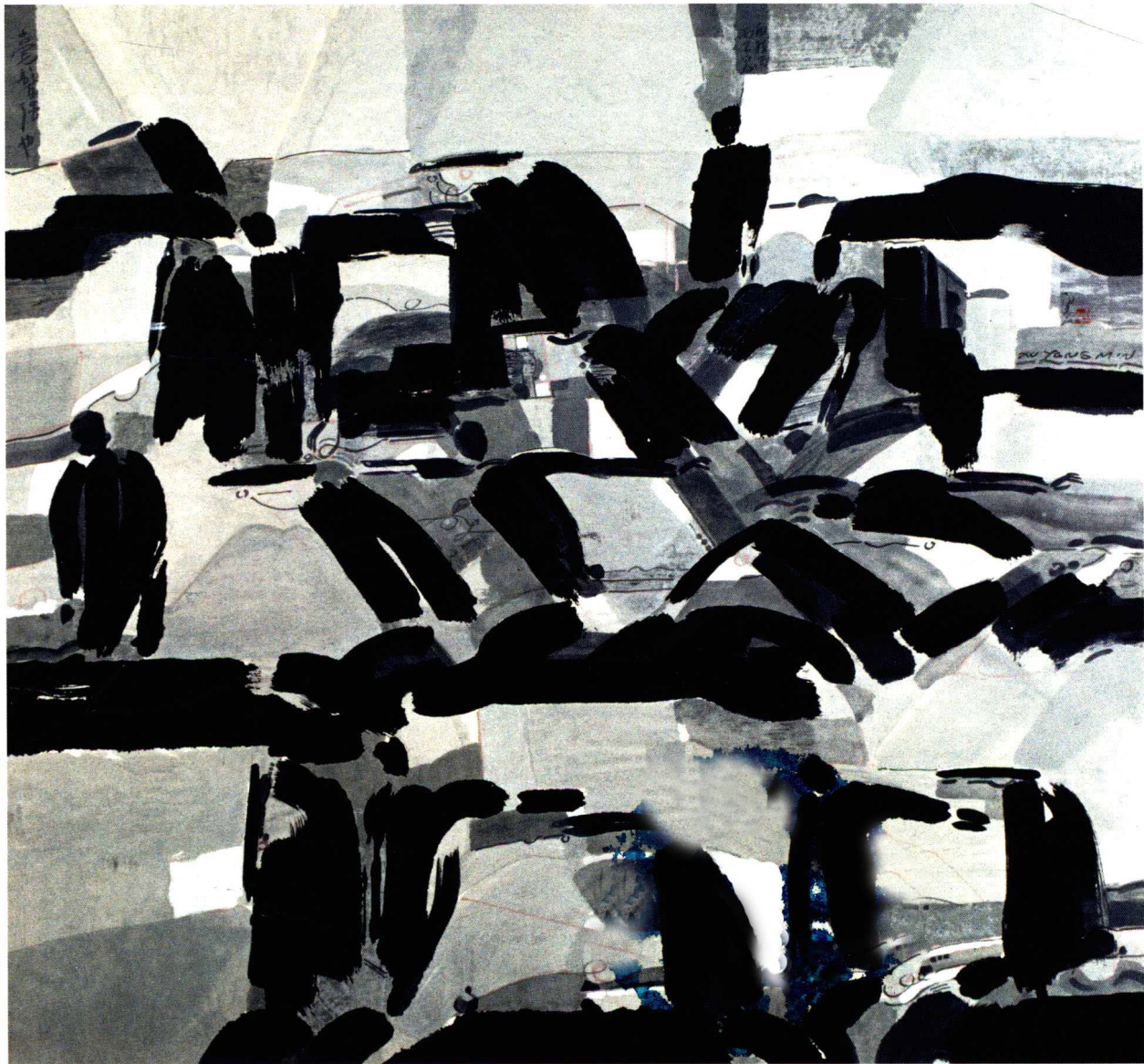
POLO · 马球 · 2000