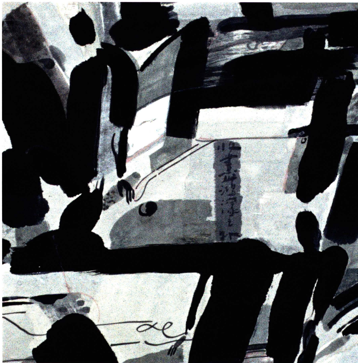
POLO · 马球 · 2000(局部 Part)