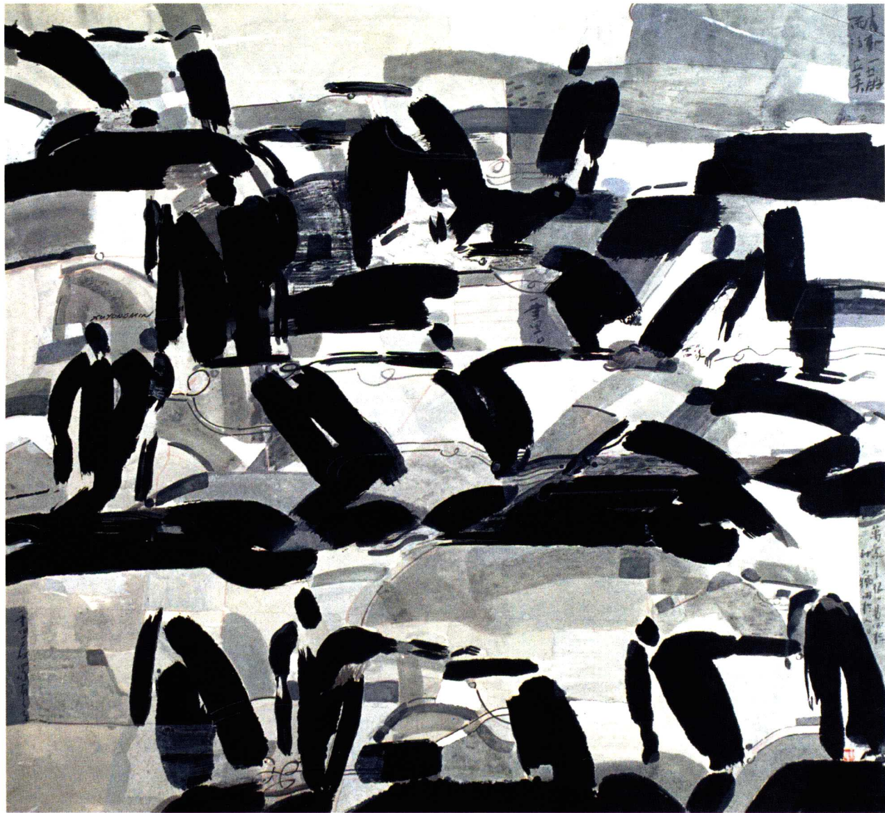
POLO · 马球 · 2000