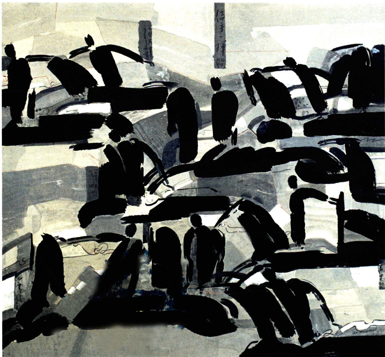
POLO · 马球 · 2000