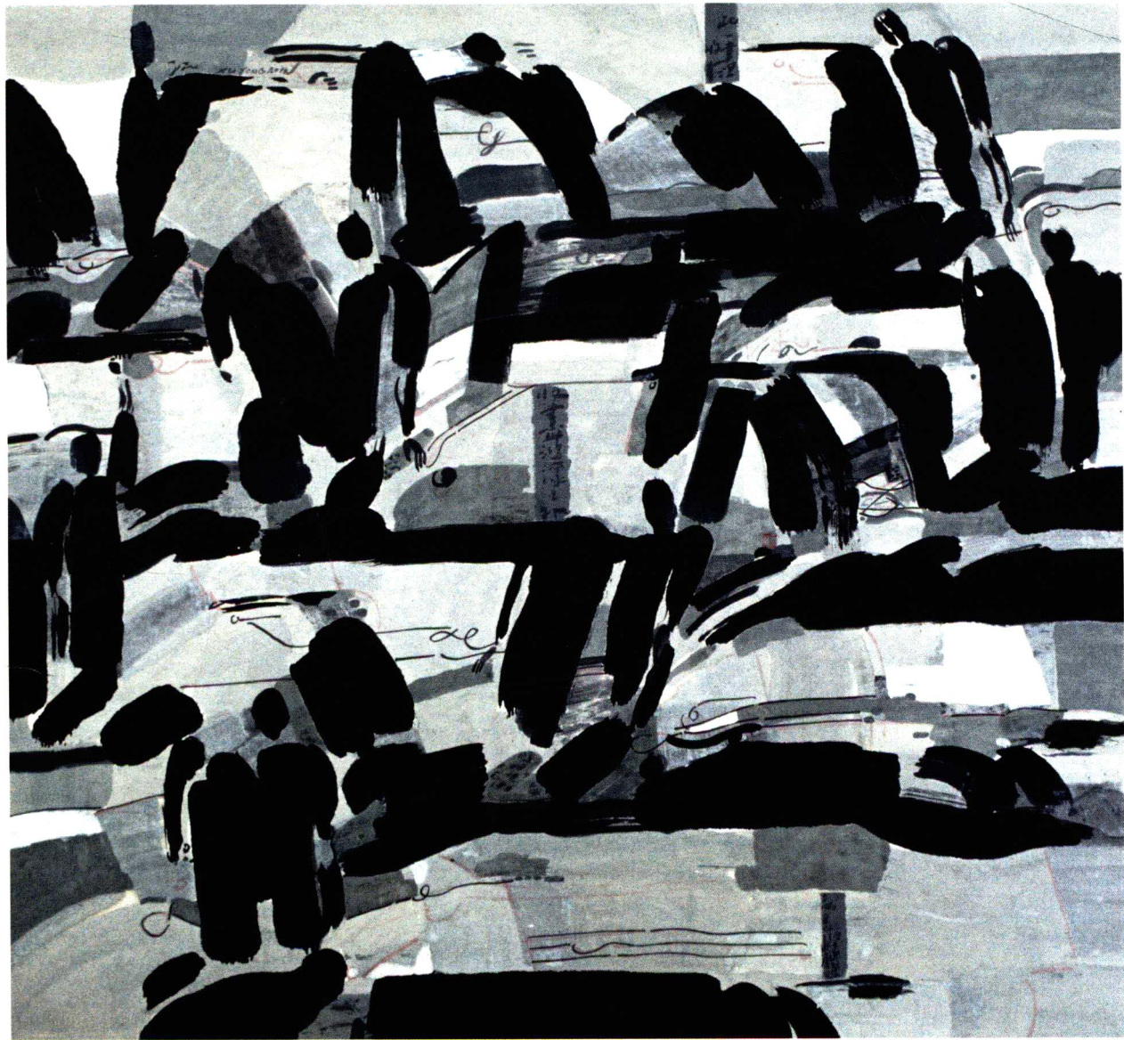
POLO · 马球 · 2000