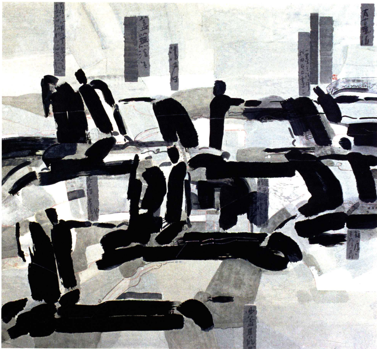
POLO · 马球 · 2000