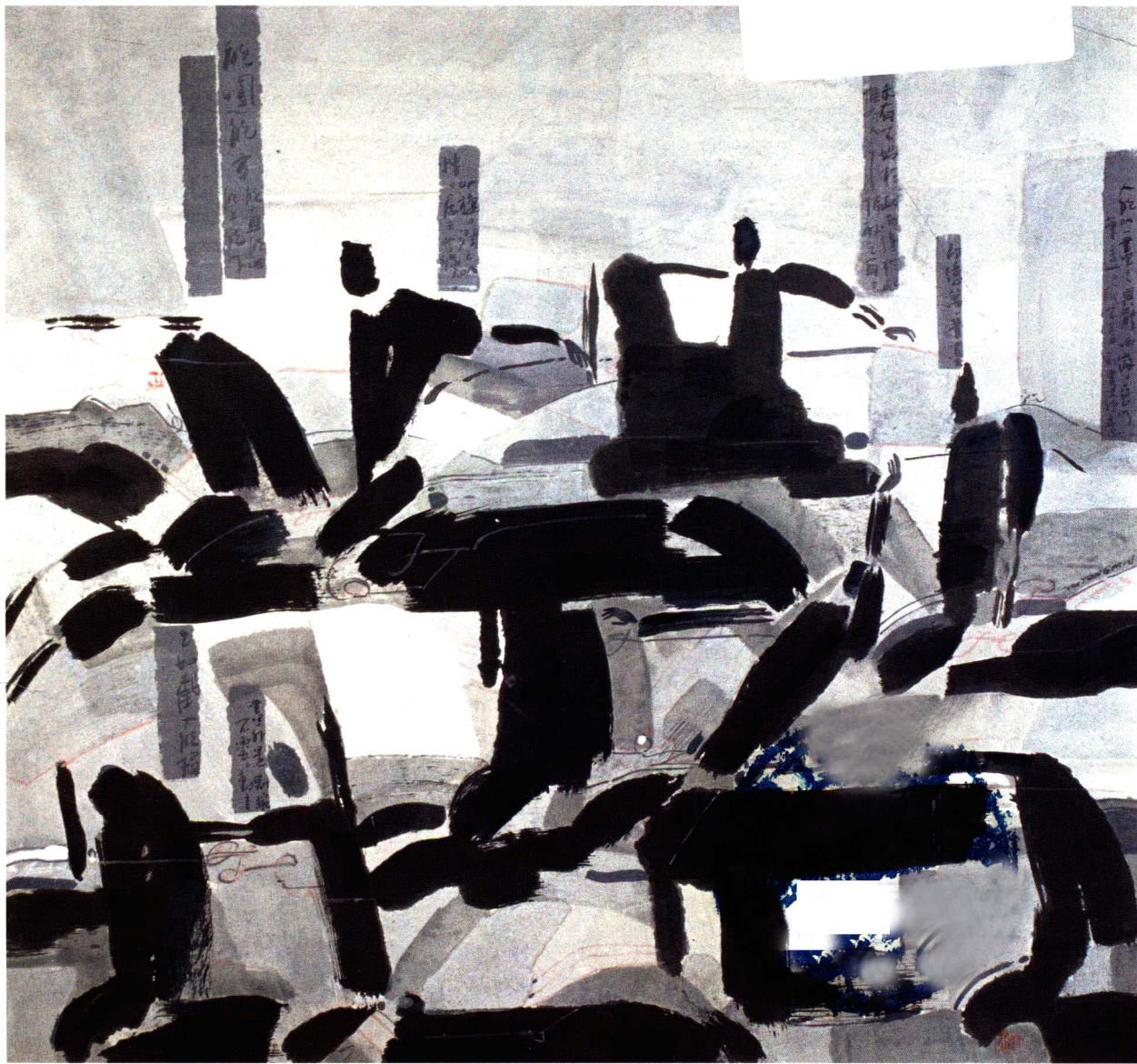
POLO · 马球 · 2000