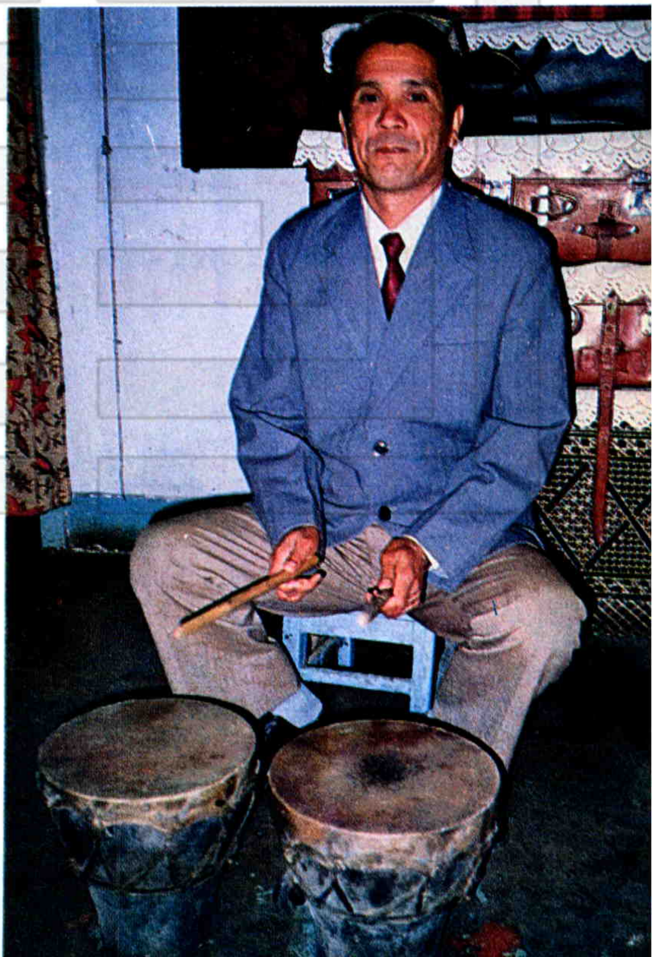
图版5 中国维吾尔族的“纳格拉” The Chinese Uyghur "Nagla"

The "Meshrep" in the Chinese Uyghur "Kashgar Mukam"