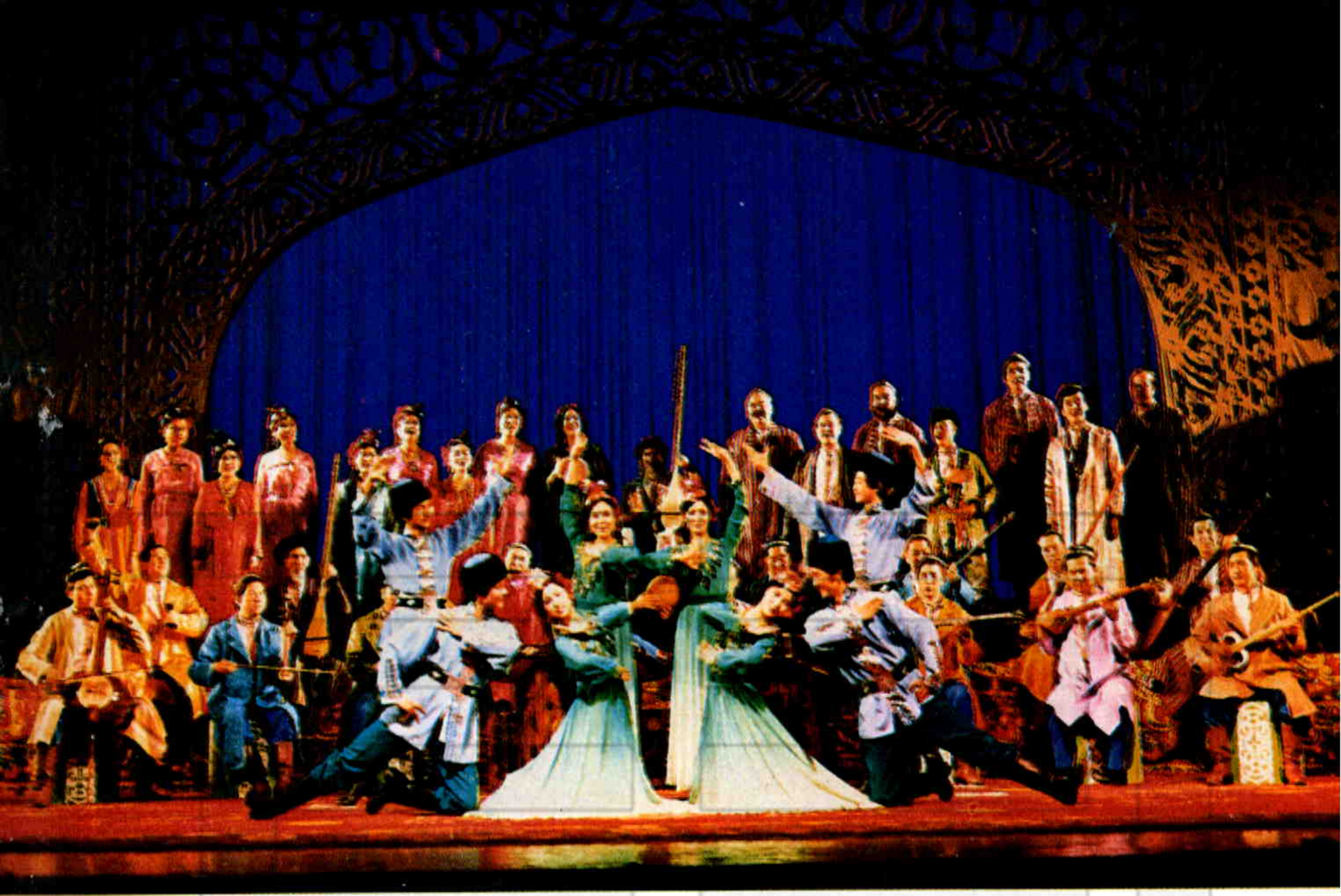
图版6 中国维吾尔族“喀什木卡姆” 中的“麦西热甫”形式

The "Meshrep" in the Chinese Uyghur "Kashgar Mukam"