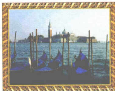
The City of Venice 威尼斯城