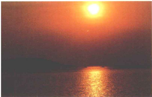
• 太湖风光 Sceneries of Taihu Lake

利永陶器商店、最早的紫砂职业学校——宜兴陶瓷职业学校，也都诞生在这里。而丁蜀镇的古南街，更是阅读古老紫砂文化的最佳去处。