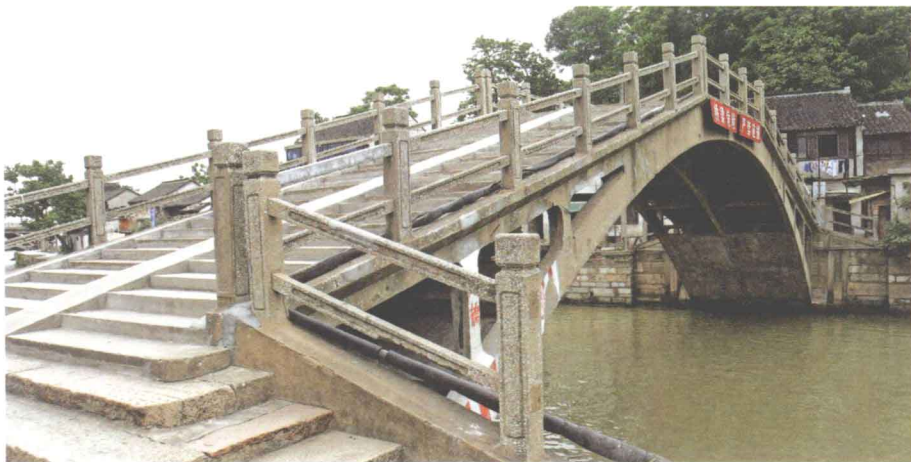
• 丁蜀镇的跨河桥 Stone Arch Bridge in Dingshu Town

Entering the town, one will find the river is fulfilled with boats of varied sizes, all loaded with purple clay products ranging from jars to tanks and pots to bowls. The banks of the river too, are occupied with these goods, even some houses and archways are made of purple clay. A large number of pottery shops line the edges of the streets of this town, and most of the shop plaques, gates of the housing, street light poles and dust bins, are built with this material.