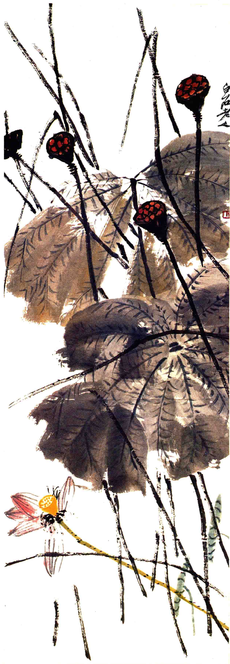
齐白石 Qi Baishi