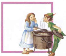
Table of Contents 目录