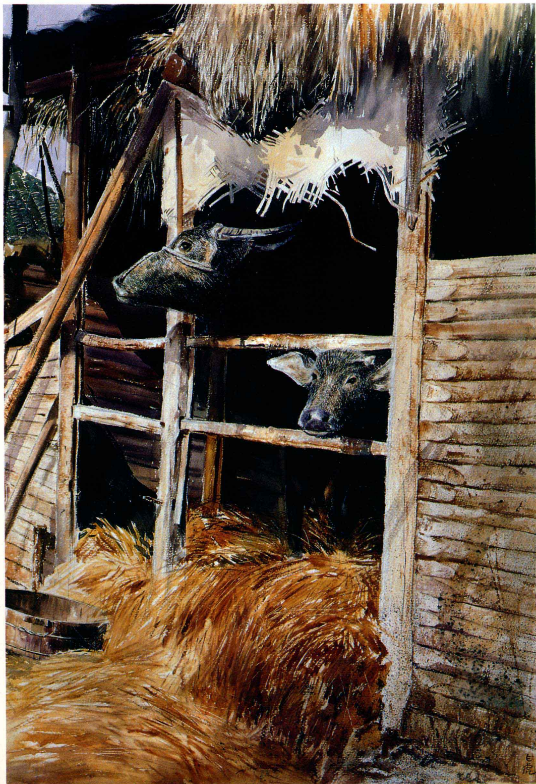
母與子(79×54cm) Mother and Son