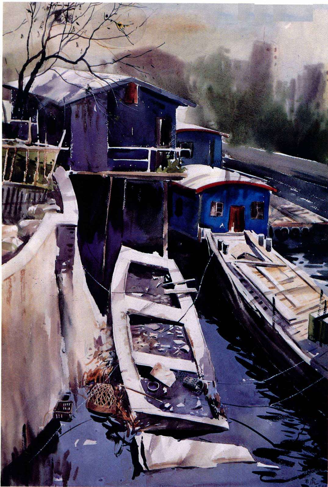
城外有條河(79×54cm) A River outside the City