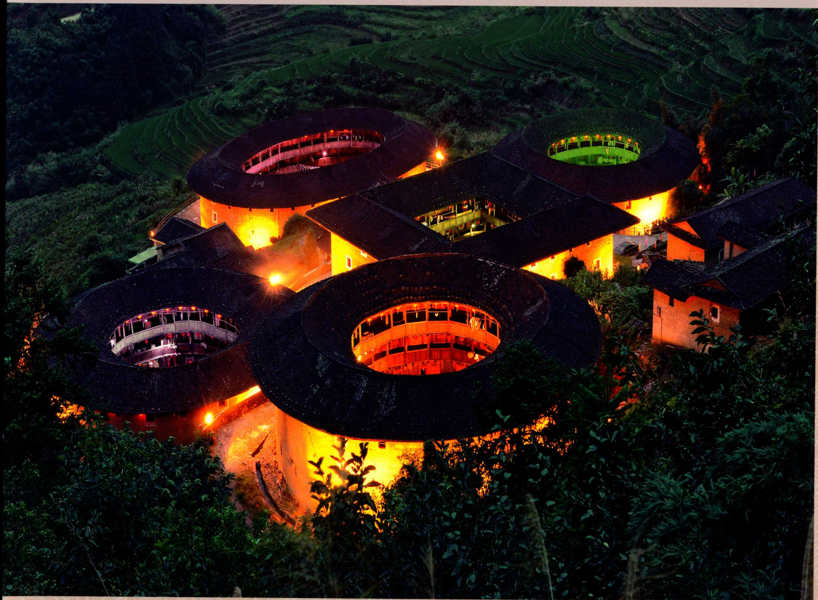
土楼夜色 The Night Scene of Tulou