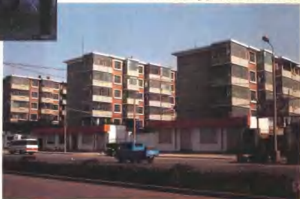
職工宿舍 Living quarters for staff and workers

The old cadres were carrying rich culture action