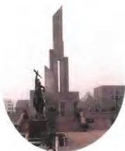
石家莊解放紀念碑 Liberation Monument