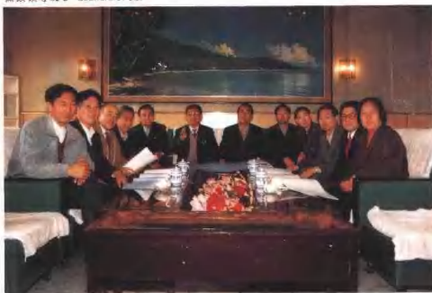
黨政領導班子 Leaders of Co.

近年來，先後完成了 107 個道路拓寬工程，紅旗大街排水頂管工程、汽車廠操場道路排水路燈工程、石家莊市總路水車建設工程以及聯盟小區、自強小區、污水處理廠、機務段、醫藥基地、城區路燈改造等國家、省、市重點配套工程，其中多項被評為省、市優質工程。1994 年以來，我處又承擔了二環路和土質莊鐵路立交橋、桃園橋、提溝技術開發區、豐收路排水等一系列標準高、難度大的重點工程項目，年工作量由 1976 年的 190 萬元、1985 年的 785 萬元，增長到 1994 年的 9000 余萬元。1995 年可望突破億元大關。我們這支隊伍已成為為省會市政維護建設戰線上的一支生力軍。