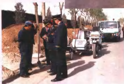
市政監察人員糾正違章 Supervisors were correcting regulation

Continually expand municipal management team