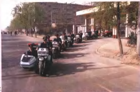
市政監察人員出發執行任務 Supervisors were at work

Continually expand municipal management team