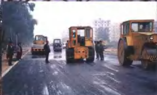
建設中的二環路工程 Er Huan road project was founding