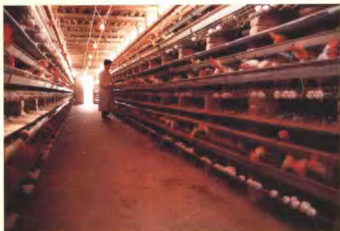
養殖業興旺發達 Flourishing aquaculture