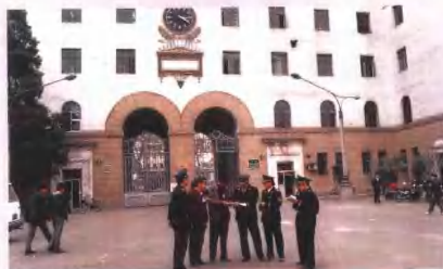
排水收費人員執行任務 Drain charge collector was at work