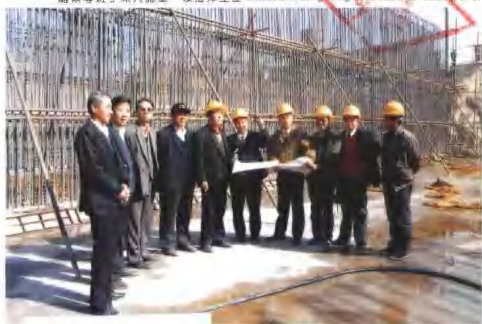
處領導班子深入施工一線指揮生產 Leaders were building production in building site.

Recollections of the past, we feel honor; look into the future, we will full of hope. We will be a heart of line and pole, a park, stand Shijiazhuang, toward homeland abroad. We will reclaim, wide construction zone, enter new construction, four the best" standard, modernize city, at the same time, we will hope to careful, help with leaders and society friends.