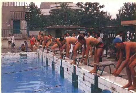
游泳比賽 Swimming tunks