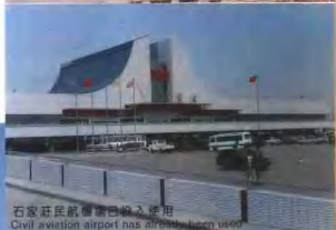
石家莊民航機場已投入使用 Civil aviation airport has already been used