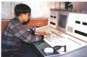
先進的路燈微控設備 Advanced road lamp computer equipment