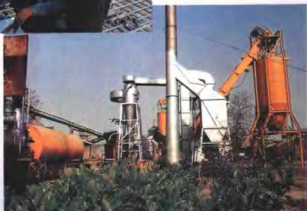
大型瀝青拌和機 Large asphalt mixing machine

水泥製品廠生產的排水管道 Drain water pipes were produced by cement products plant