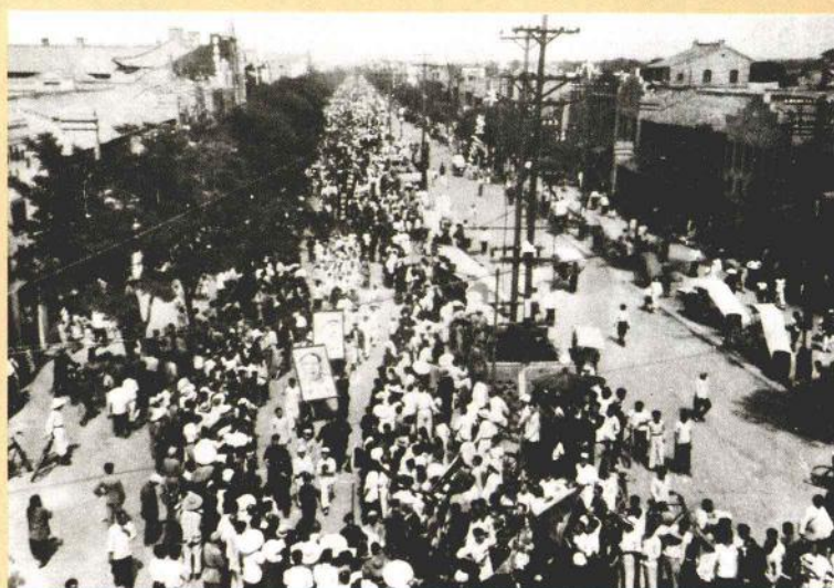
1949 年 5 月 20 日，西安人民歡慶解放。 People of Xi'an joyously celebrating the liberation on May 20th, 1949.